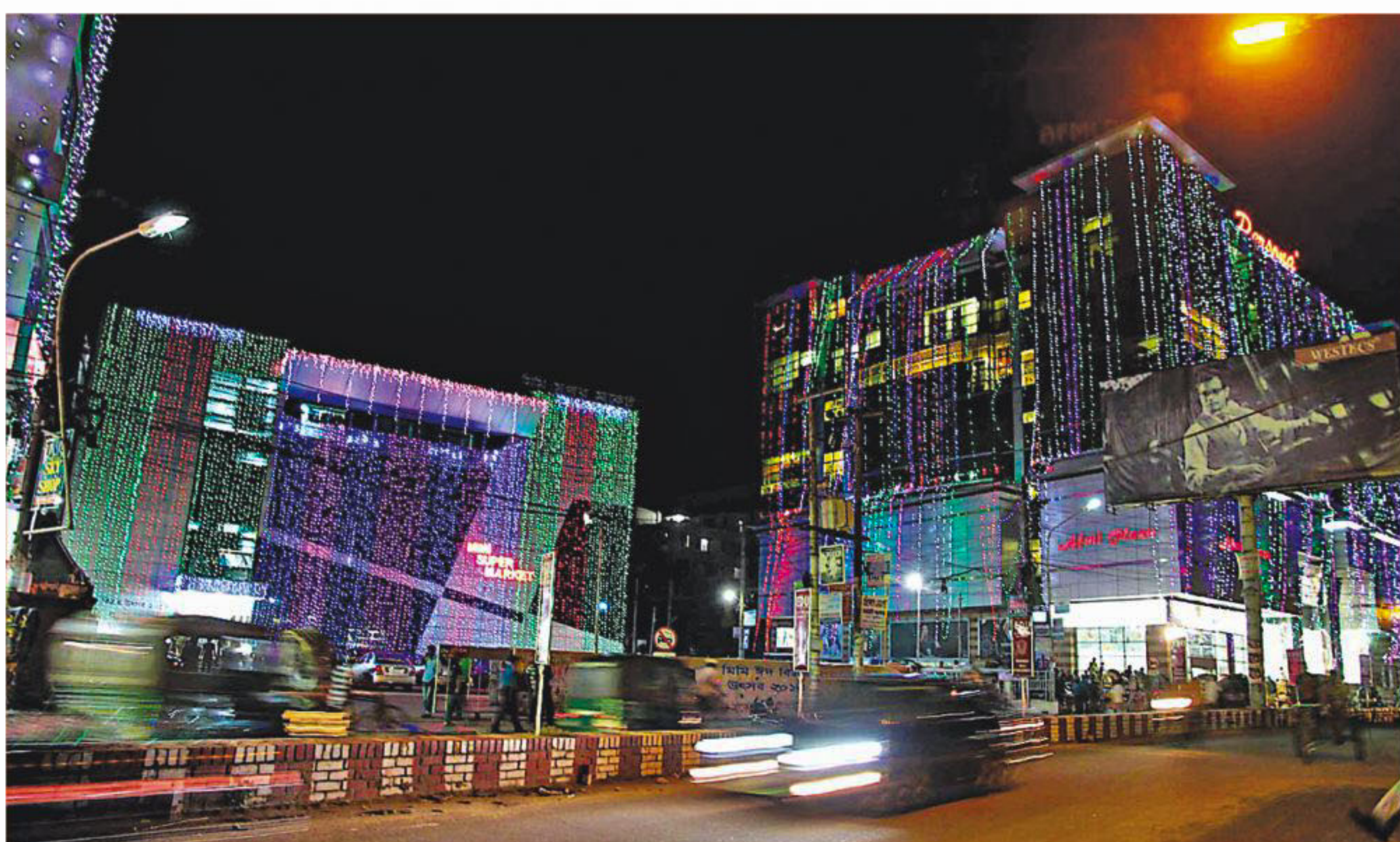
Bright string lights illuminate two shopping malls in Nasirabad area of Chittagong city. Most of the large markets in the port city have been decorated with lights since the beginning of Ramadan, defying a government bar on such decoration. The photo was taken recently.

He claimed that the government has lost the five city corporation polls because of the Gonojagoron Mancha, which was regenerated under the government's supervision.