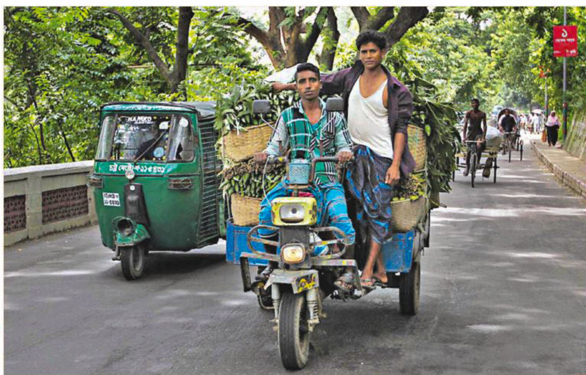
Violating rules, a motorised three-wheeler runs on a road in Tiger Pass Area of Chittagong city. The picture was taken on Thursday.