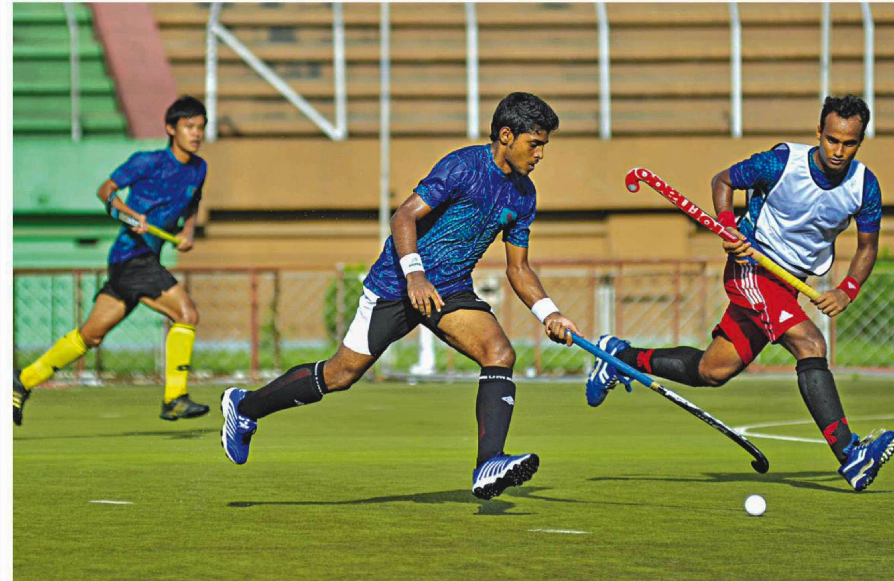
National hockey players go through their paces in a practice session as part of the preparatory camp for the Asia Cup in September at the Maulana Bhasani Hockey Stadium yesterday.

The 'Happy One' won two Premier League titles, two League Cups and the FA Cup during his first stint at Chelsea.