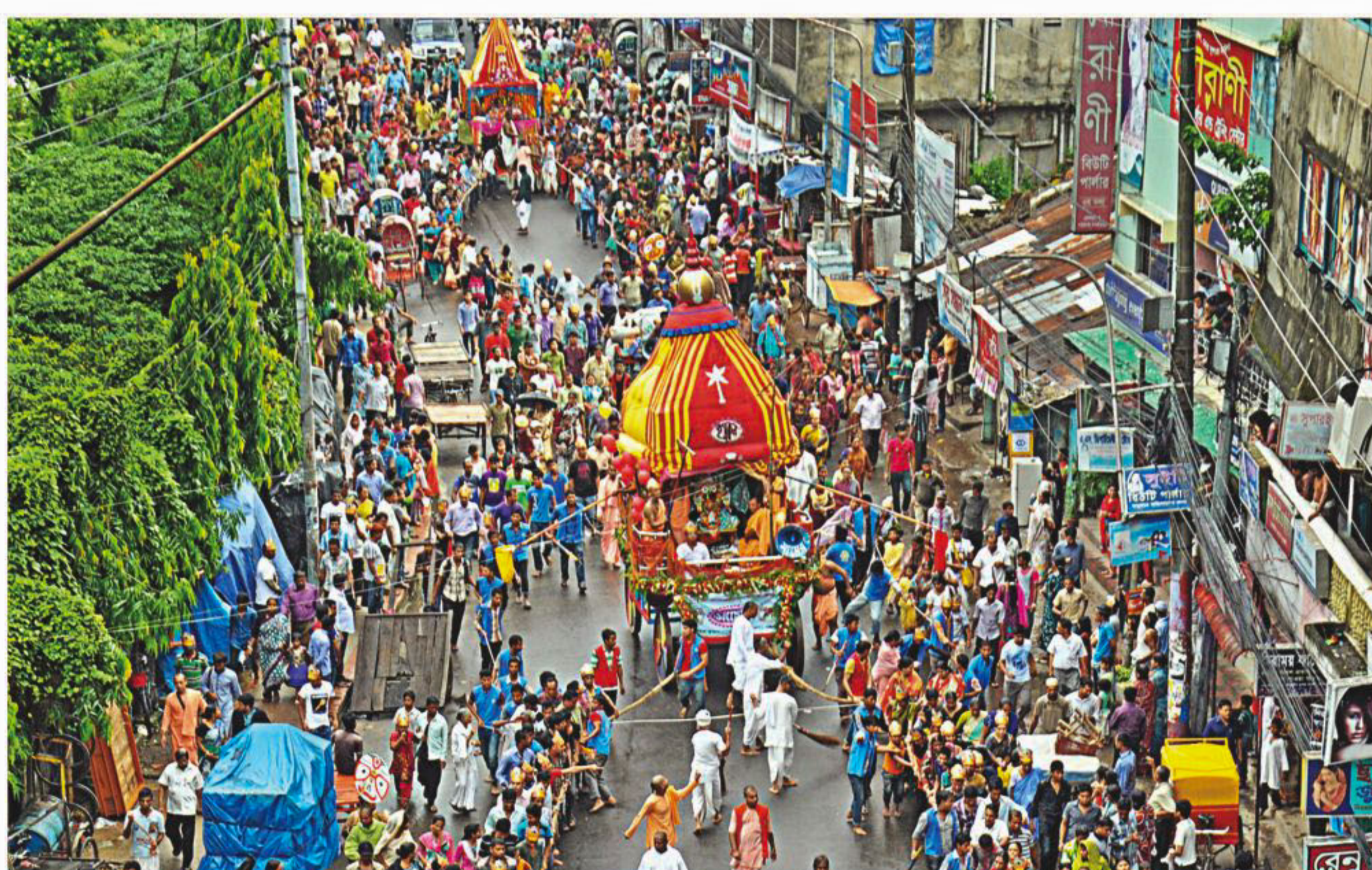
Thousands of Hindus join the Ula Rathjatra, which marks the return journey of Lord Jagannath to his temple from his garden palace in the countryside, at Nandan Kanan intersection in Chittagong city yesterday. The occasion occurs eight days after the Rathjatra, the chariot journey of Lord Jagannath, which is one of Hindus' biggest annual festivals.

"They have to think about getting admitted into university. I urge university authorities to take in students who have earned medals internationally without making them go through the regular admission procedure, so that they can spend more time in specializing," recommended Zafar Iqbal, claiming that Shahjalal International University of Science and Technology already does so.