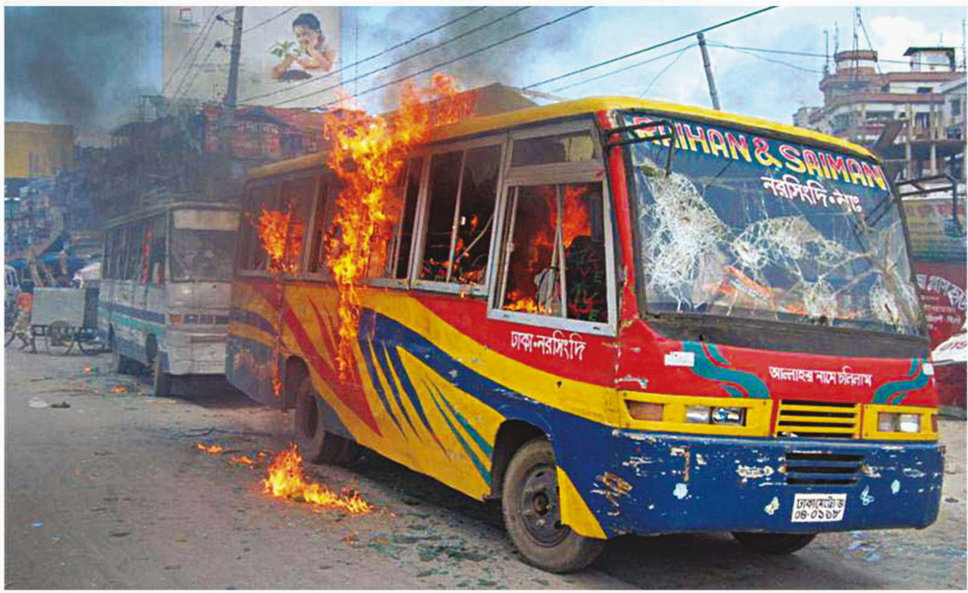
Buses set alight by pickets on Dhaka-Chittagong highway in Naryanganj during the hartal enforced by Jamaat-e-Islami yesterday.