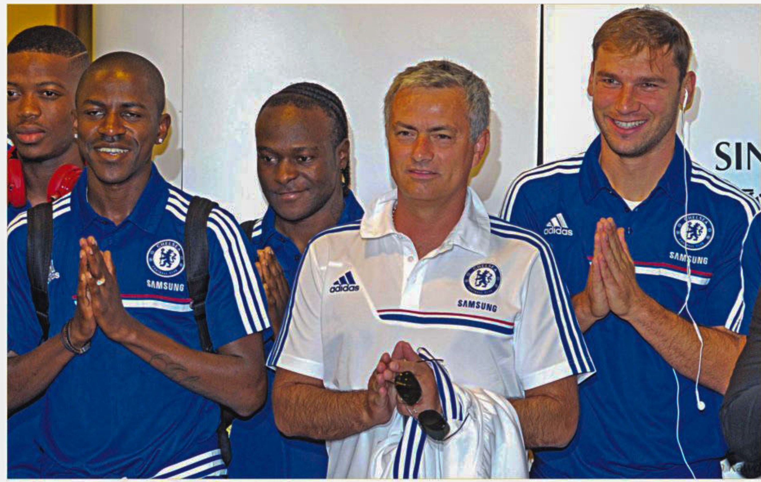
Chelsea manager Jose Mourinho (C) and players give a traditional Thai greeting after arriving at the Suvarnabhumi International Airport in Bangkok yesterday.

"I thought long and hard with the people around me and I came to the conclusion that it was a unique offer and opportunity, one I couldn't refuse," a tearful Illarramendi, a product of San Sebastian-based Sociedad's youth academy, told reporters. "I will give my all in all the training sessions and if I play I will give my all then too," he added. "I love (Sociedad) but a decision had to be taken and of course Real Madrid excites me too." Real are looking to bounce back from a poor season under former coach Jose Mourinho, who quit and returned to Chelsea after failing to win any major silverware. Portuguese Mourinho was replaced by Italian Carlo Ancelotti, whom Real bought out of his contract with French champions Paris St Germain. Under construction magnate Perez, Real have spent hundreds of millions of euros on players but have failed to win the 10th European crown they have been chasing since their last continental triumph in 2002.