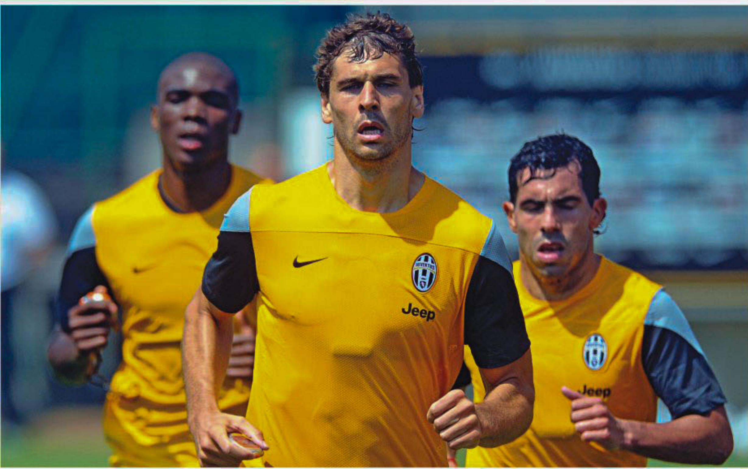
Juventus striker Fernando Llorente (C), flanked by teammates Carlos Tevez (R) and Angelo Ogbonna, runs during a training session in Valle d'Aosta yesterday.