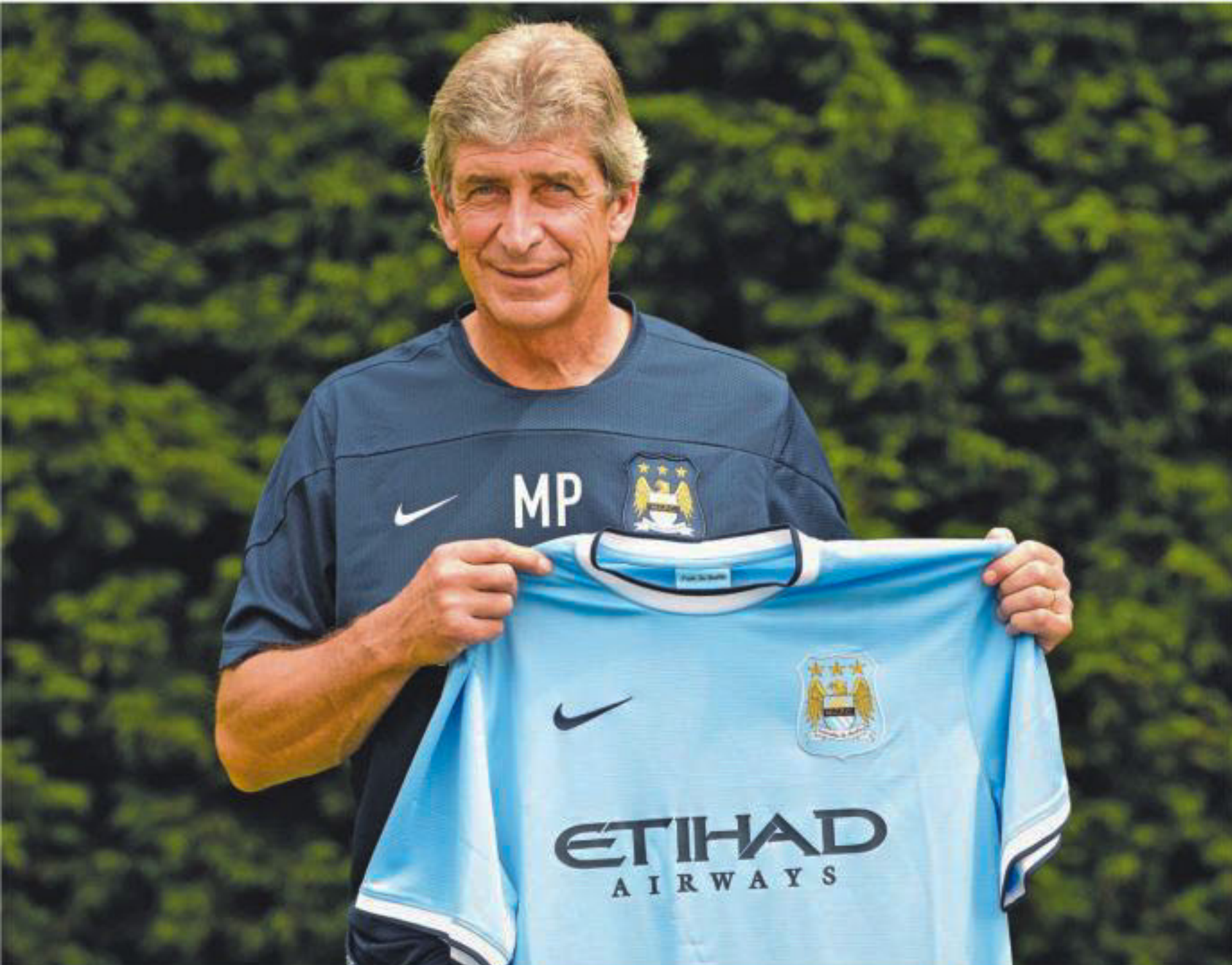
Manchester City's new manager Manuel Pellegrini holds a club jersey at their Carrington training ground on Wednesday.

INDIA: Rohit, Dhawan, Kohli, Karthik, Raina, Dhoni, Jadeja, Ashwin, Bhuvneshwar, Ishant, Vinay. Toss: India.