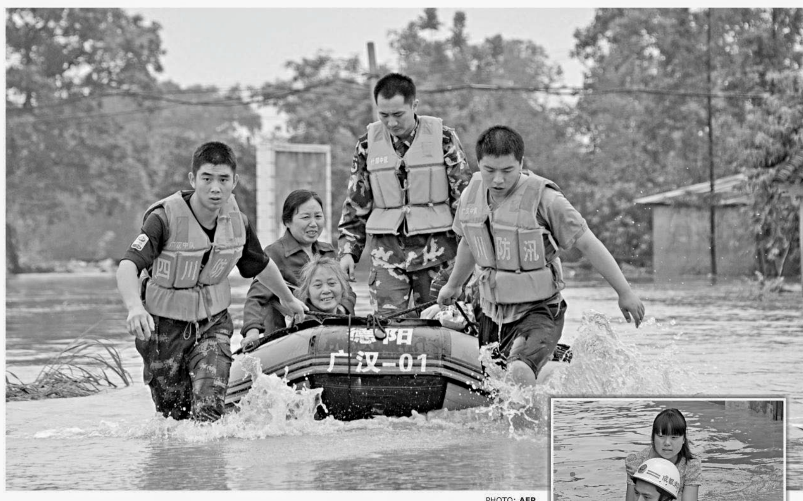
Rescue workers help to relocate flood victims in the Sanshui township of Guanghan, southwest China's Sichuan province yesterday. Landslides crushed homes, bridges collapsed, and dozens of villages were cut off. Inset, a rescuer helps relocate a girl.

Luxembourg Prime Minister Jean-Claude Juncker, Europe's longest-serving leader, tenders his resignation yesterday in a scandal involving the tiny nation's secret services, alleged to have indulged in misconduct on his watch. Though aged only 58, Juncker has been in office for 18 years and in government for 30. He is best known in Europe for his recent tumultuous eight-year stint as head of the eurozone finance ministers group, which ended in January.