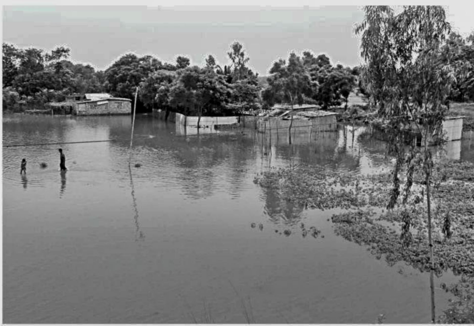
A flooded area of Mazadanga village in Dinajpur Sadar upazila.