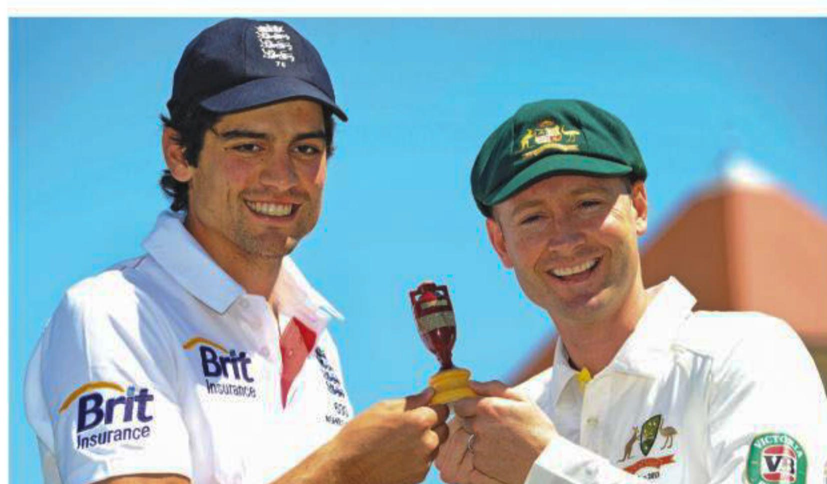
England captain Alastair Cook (L) and his Australia counterpart Michael Clarke pose with the Ashes urn at Trent Bridge yesterday.

Australia were thrashed 4-0 in India, where England won late last