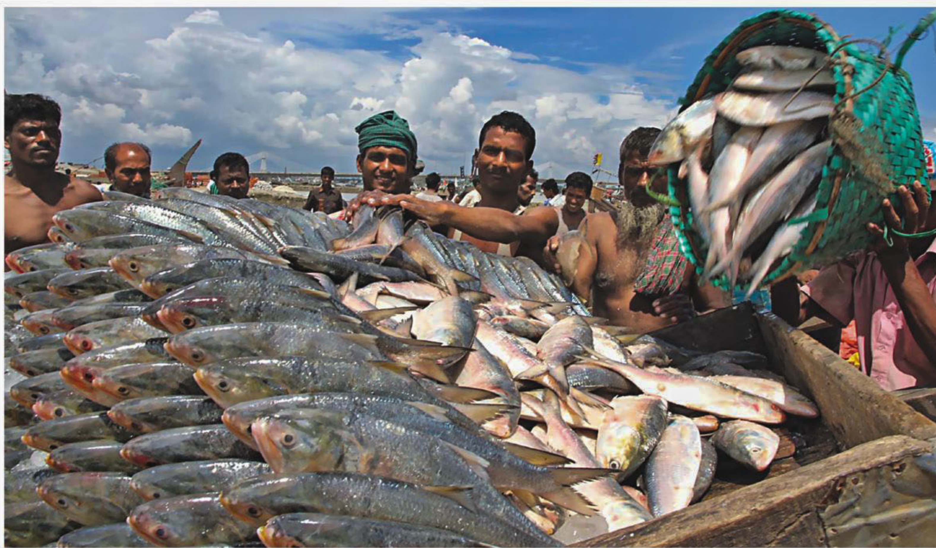
A good catch in the Bay. However, fishermen say hilsas are not found in abundance these days, in contrast to what used to be once. These fish are being loaded on trucks at Firingibazar in Chittagong yesterday.