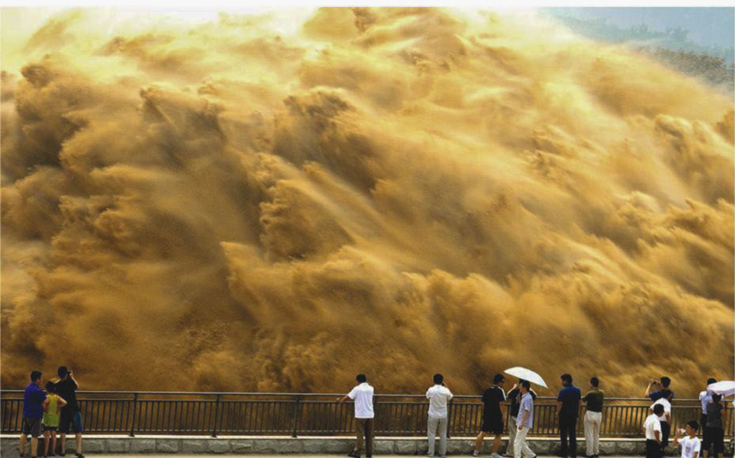
Visitors watch water gushing from a section of the Xiaolangdi Reservoir on the Yellow River in Henan province, China, during the annual sand-washing operation to move 30 million tonnes of silt downstream. The operation lowers the riverbed in the lower reach by an average of 2.03 meters each year.

THE TELEGRAPH ONLINE Five Indonesian men have been trapped in a tree for days after being chased into its branches by Sumatran tigers, who mauled a sixth man to death. Four of the animals were still surrounding the base of the tree following their initial attack on Thursday, which they launched after the men accidentally killed a tiger cub. The men entered the Mount Leuser National Park in the SEE PAGE 13 COL 3