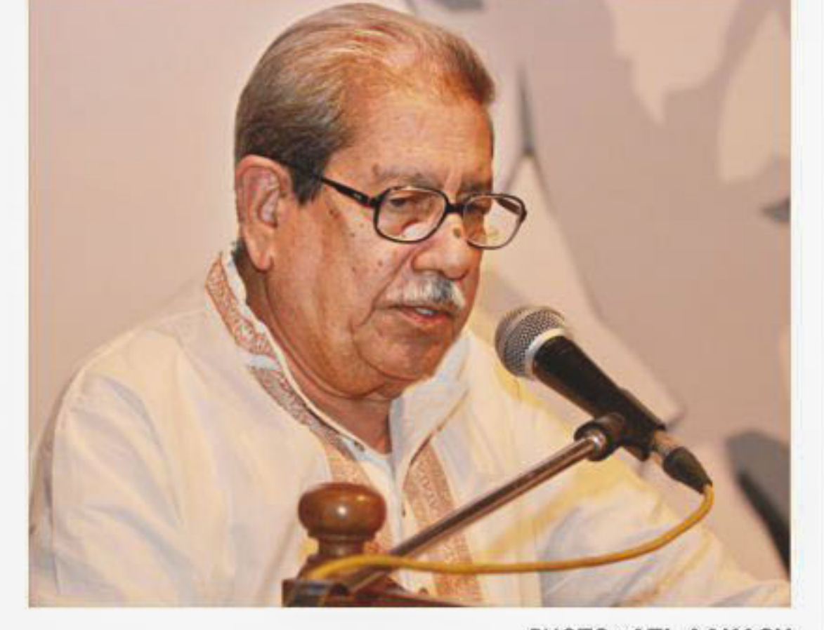
Professor Anisuzzaman speaks at the programme.

On the occasion of the first death anniversary of architect Muzharul Islam, Muzharul Islam Foundation, Bangla Academy and the Institute of Architects, Bangladesh (IAB) jointly organised a memorial meeting at the auditorium of Abdul Karim Sahitya Bisharad in Bangla Academy on July 6.