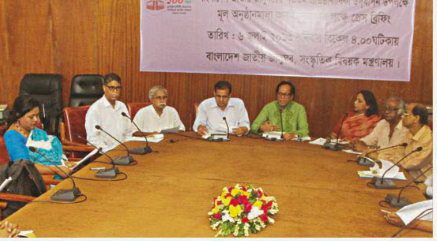
Speakers at the press conference.