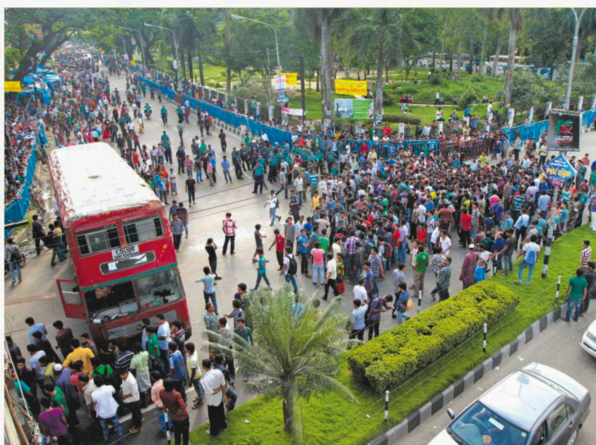
Students of Dhaka University block off Kazi Nazrul Islam Avenue in the capital after a Dhaka University bus was vandalised by some Tejgaon College students. The vandalism ensued after some of the college students were refused a ride on the bus. Inset top, While vehicles wait patiently during the road block, a bus of Jagannath University arrives at Banglamotor after driving on the wrong side of the road all the way from Ruposhi Bangla Hotel. Inset bottom, The rows of vehicles stuck on Kazi Nazrul Islam Avenue.

After his He was buried at Faridpur graveyard in Dinajpur town following his namaz-e-janaza.