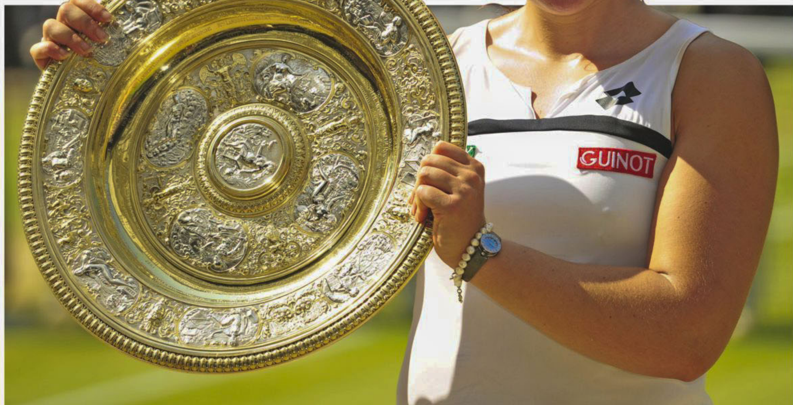
France's Marion Bartoli smiles as she holds the Venus Rosewater Dish, the Wimbledon women's singles winner's trophy, after defeating Sabine Lisicki of Germany 6-1, 6-4 in the final at the All England Club in Wimbledon yesterday.

There might even be another Relegation League where two bottom teams of BCL and top two teams of Club Cup Championship will be playing for places in the BCL, the second-tier professional league.