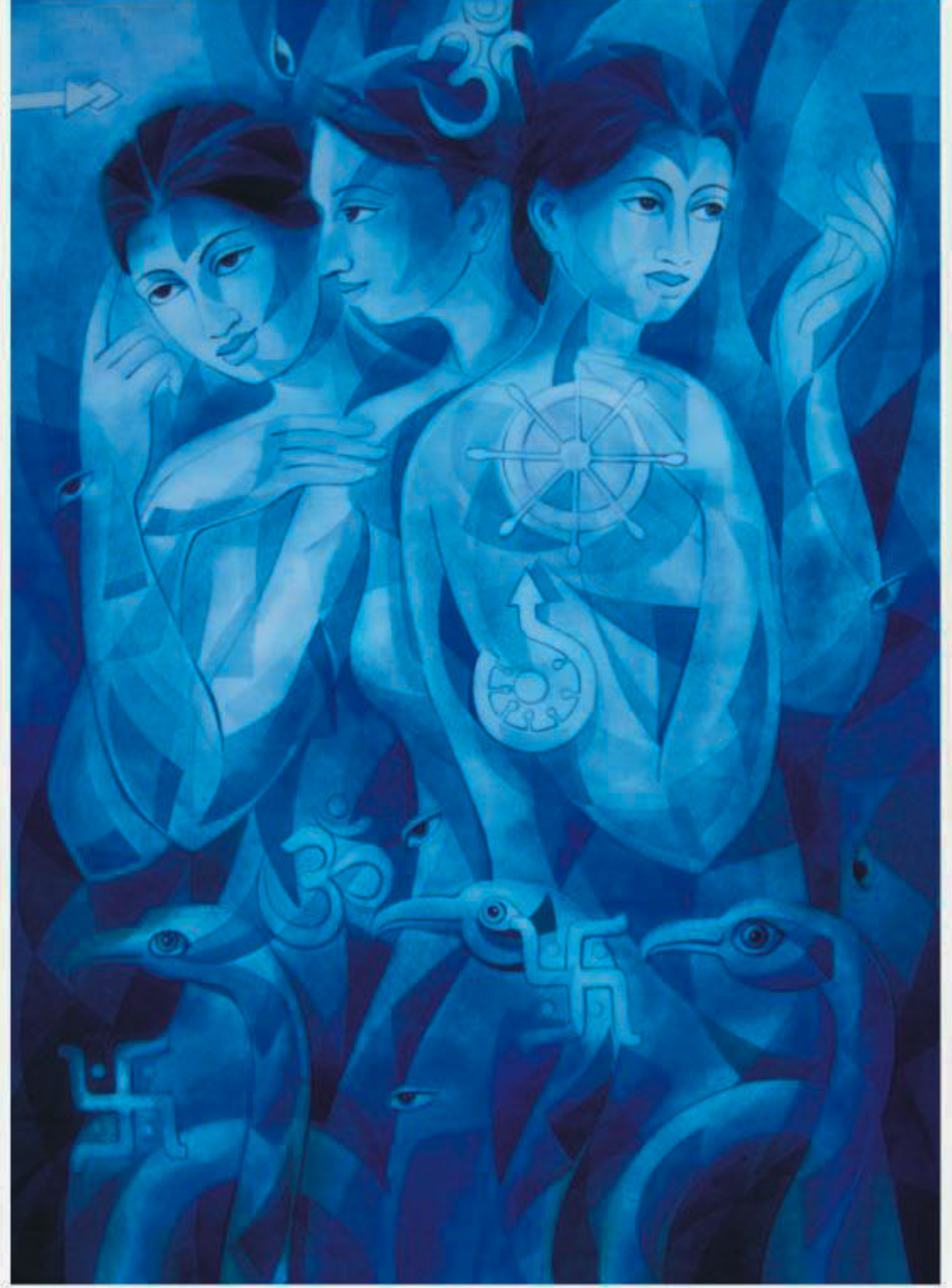
A watercolour by Gopal Chandra Saha.

Several of Saha's works denote serenity and crystal blue has been focused. It seems that the shade is the symbol of quietness and has a heavenly touch. His watercolours have a sense of sophistication and tranquility about them. The works are elegant with striking female figures and varied symbolic representation. Over the years, sitting women, contemplative and romantic belle as