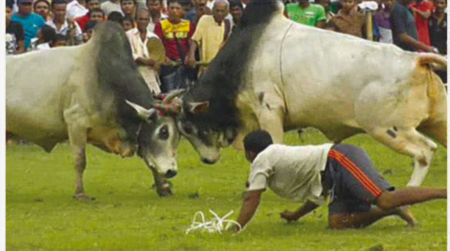
PONUUEL S BOSE, Narail

A traditional bull-fight was held at Ujirpur village under Narail municipality of the district on Tuesday.