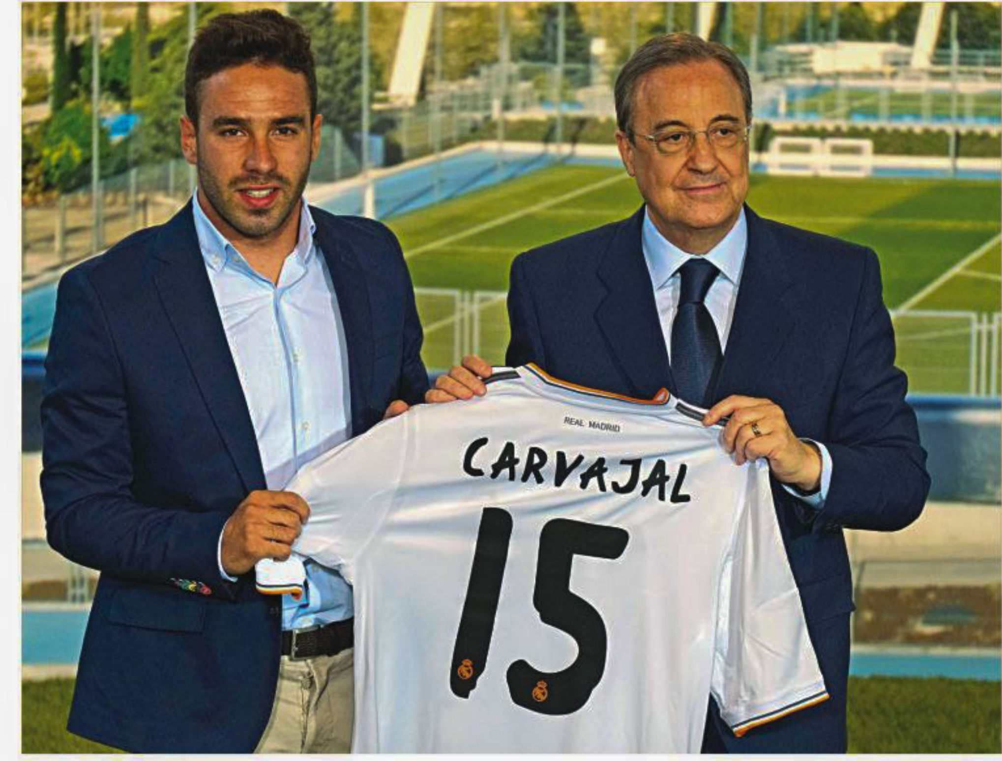
Real Madrid full-back Carvajal (L) poses with club president Florentino Perez during his official presentation at the Bernabeu yesterday. Carvajal returned to Madrid after a loan spell at Bayer Leverkusen.

REUTERS, Manchester New Manchester United manager David Moyes was adamant on Friday that striker Wayne Rooney was not for sale but stopped short of saying the player had changed his mind about wanting to leave. The issue dominated the Scot's first news conference since he took over from the retired Alex Ferguson. His predecessor said in May that the England international had asked for a transfer. "I've had a chance to speak to Wayne ... the fact of the matter is Wayne is not for sale," Moyes said at Old Trafford, home of the Premier League champions. "He is a Manchester United player and will remain a Manchester United player. I've known Wayne since he was 16 ... he's training very well, he's come back in good shape and I really look forward to working with him." Moyes was repeatedly asked about Rooney, including direct questions such as: "Has he told you he would like to stay at Manchester United?" but each time failed to give a 'yes' or 'no' answer. "As far as I'm concerned, the way he's working I'm more than happy to work with him and make sure we get success," said the former Everton manager. Moyes's answers will have done little to extinguish the media speculation about the future of Rooney who suffered a dip in form following the arrival of Robin van Persie.