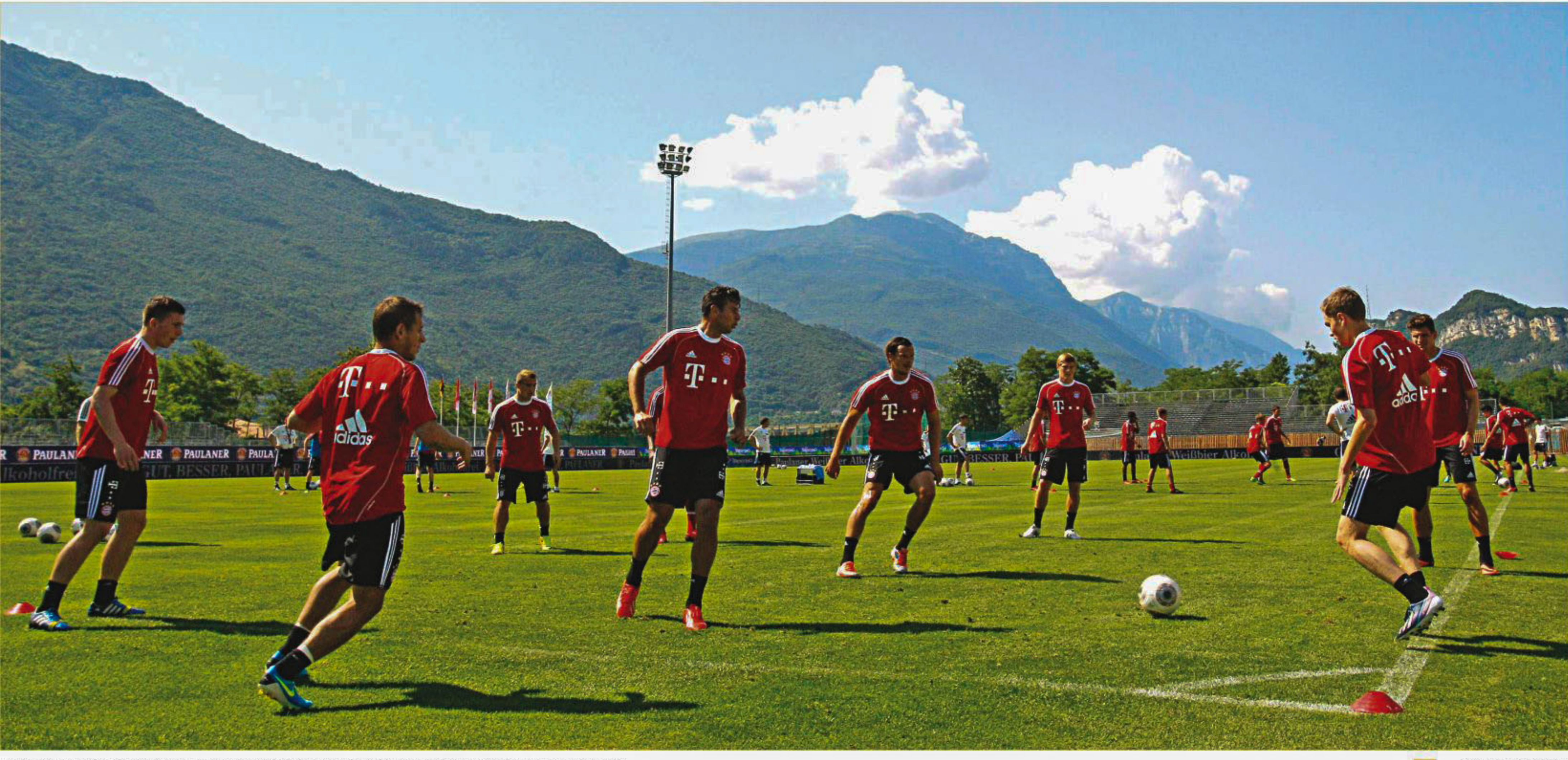
Bayern Munich players attend a training session in Arco, northern Italy yesterday.