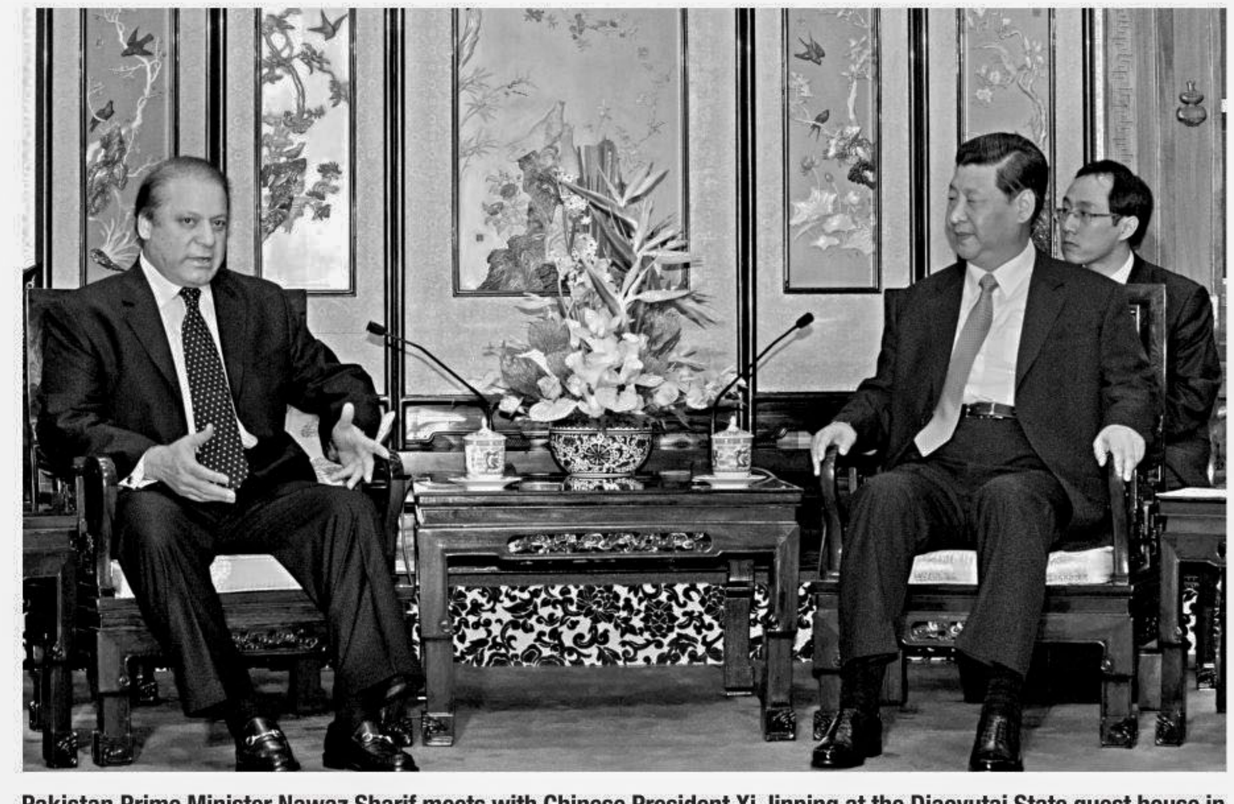
Pakistan Prime Minister Nawaz Sharif meets with Chinese President Xi Jinping at the Diaoyutai State guest house in Beijing yesterday. Sharif started his first foreign visit since his May election in China yesterday looking to secure infrastructure projects to tackle a chronic energy crisis and economic malaise.

AFP, New Delhi India's defence minister will lead a high-level delegation to China yesterday, the first such trip in seven years, as the two sides ramp up efforts to rebuild trust after a recent flare-up over a border dispute. A K Antony will meet his Chinese counterpart General Chang Wanquan during the three-day visit, with talks to include peace on their shared border as well as regional security issues, the defence ministry said. "Both ministers are expected to discuss a number of issues, including those related to maintenance of peace and tranquility on the border... and matters relating to regional and global security," India's ministry said in a statement. Antony's trip is the first by an Indian defence minister since 2006 and comes after a spat between the two nuclear-armed neighbours in May over troop movements in a disputed Himalayan border region. The Line of Actual Control has never been formally demarcated, although the sides have signed accords to maintain peace in the region that was the site of a brief Indo-Chinese war in 1962.