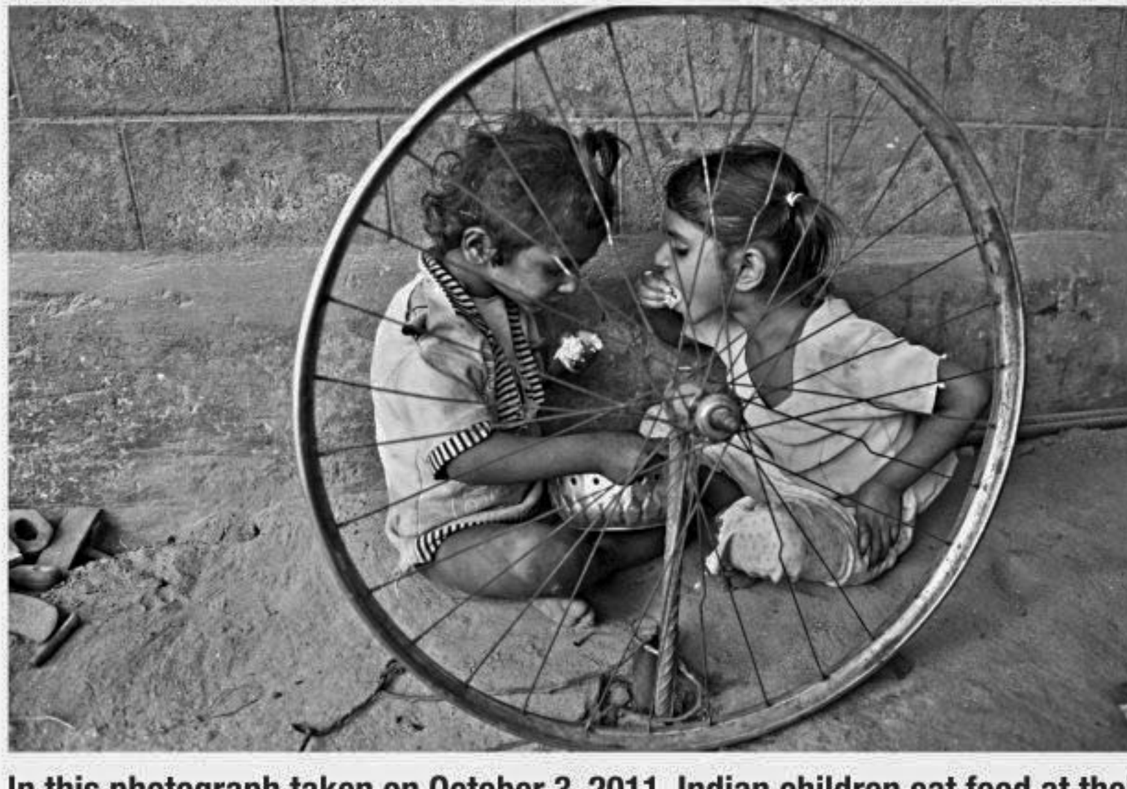
In this photograph taken on October 3, 2011, Indian children eat food at their temporary shelter on the side of the road in Hyderabad.

AFP, New Delhi India's ruling party said yesterday a vast new food scheme for the poor was a "game-changer" to fight endemic malnutrition, but analysts expressed concern about the programme's implementation and cost. The cabinet issued an executive order late Wednesday introducing the National Food Security Bill, which was expected to be approved by the president later today and be a vote-winning measure ahead of elections next year. The populist programme -- which the government says will add 230 billion rupees ($3.8 billion) per year to the country's existing 900-billion-rupee food subsidy bill -- will offer subsidised grains to an estimated 810 million people. It has been pushed strongly by the head of the ruling Congress party, Sonia Gandhi, who has insisted on honouring a 2009 election pledge despite concerns about the impact on government finances and food prices. "It is going to be a game-changer in terms of poverty eradication," senior Congress leader Tom Vadukkan told AFP. "If basic needs like hunger are not met, you can't talk about (economic) development." Despite two decades of strong economic growth, India still struggles to feed its population adequately, with a major survey last year showing that 42 percent of children under five were underweight. The food measure, which will offer five kilograms (11 pounds) per person per month for as little as one rupee per kilo, is considered key to the Congress-