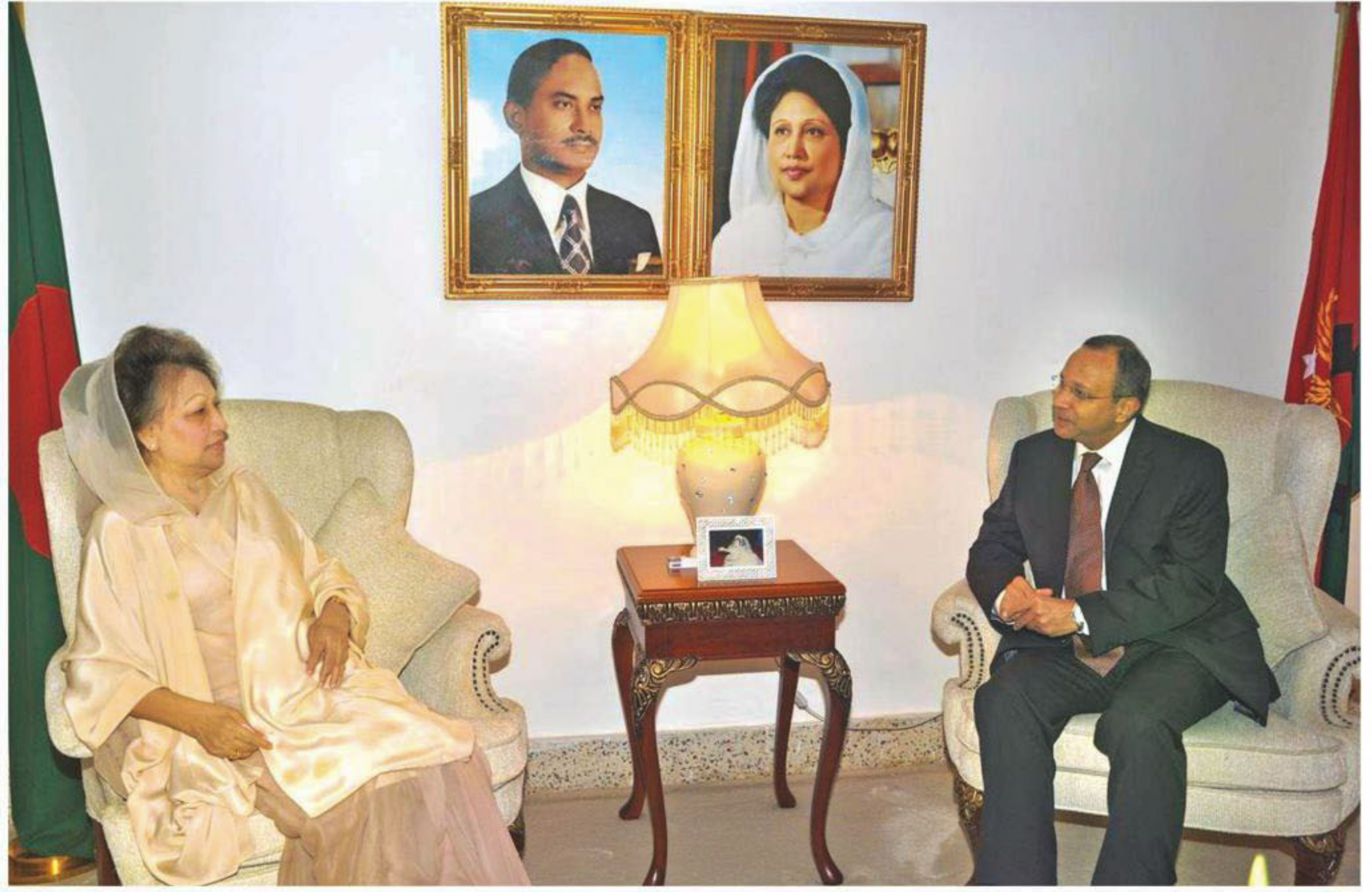
Pankaj Saran, Indian high commissioner to Bangladesh, calls on Khaleda Zia, chairperson of the opposition party BNP, at her Gulshan office in the capital yesterday.

All have been requested to pray for the salvation of the departed soul.