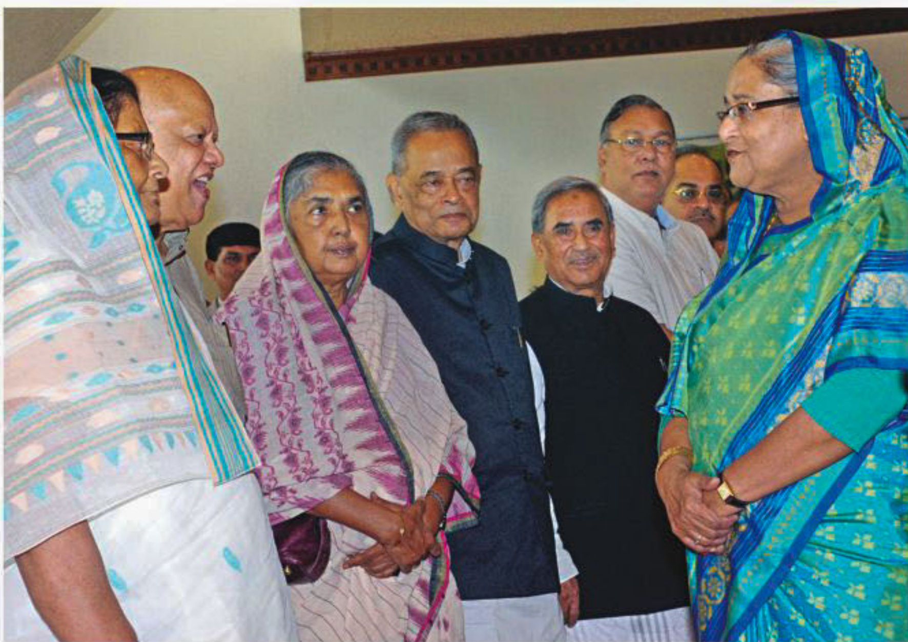
Prime Minister Sheikh Hasina exchanges greetings with cabinet members at Hazrat Shahjalal International Airport in the capital yesterday before leaving for an eight-day visit to London and Belarus.

Mobile courts of Rab, district and metropolitan magistrates will also increase drives against adulterated food sellers.