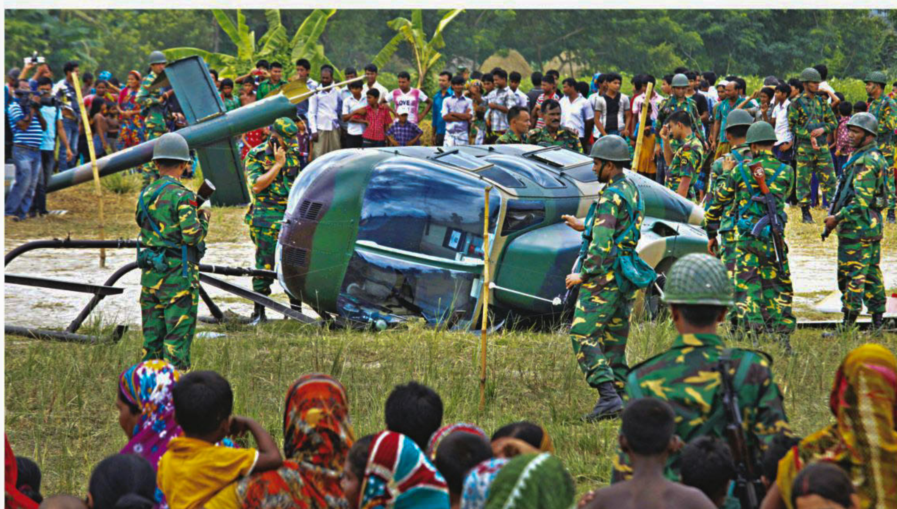
The army helicopter used for training pilots tried to make an emergency landing but crashed in a field in Dhamrai on the outskirts of the capital yesterday.