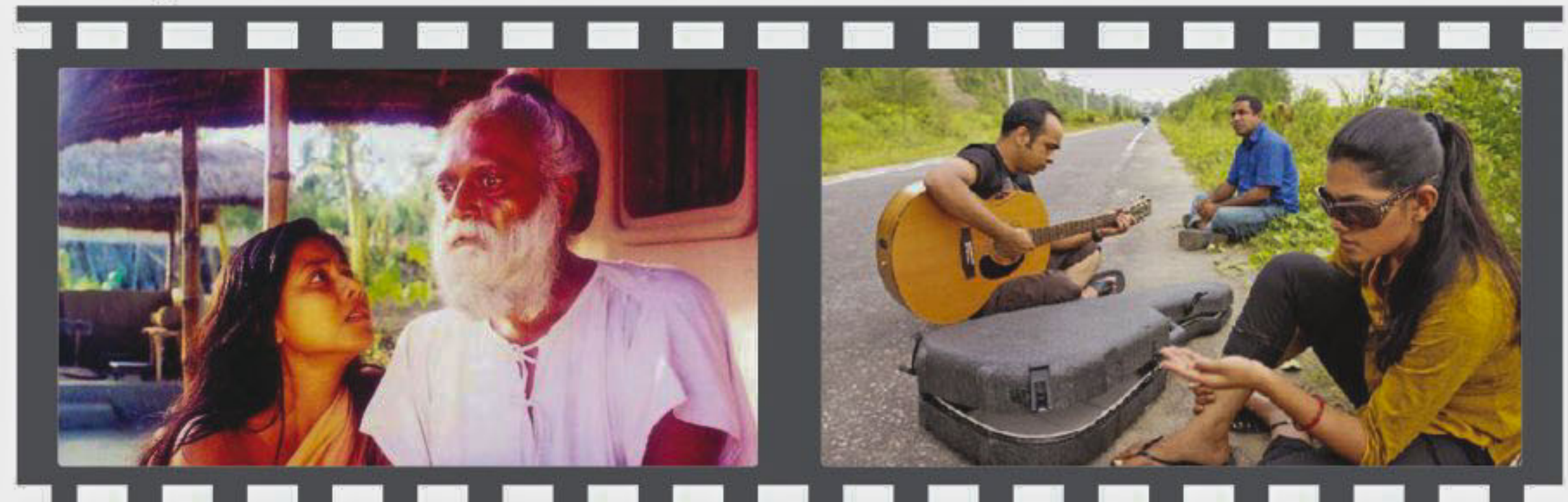
Stills from "Lalon" and "Third Person Singular Number".