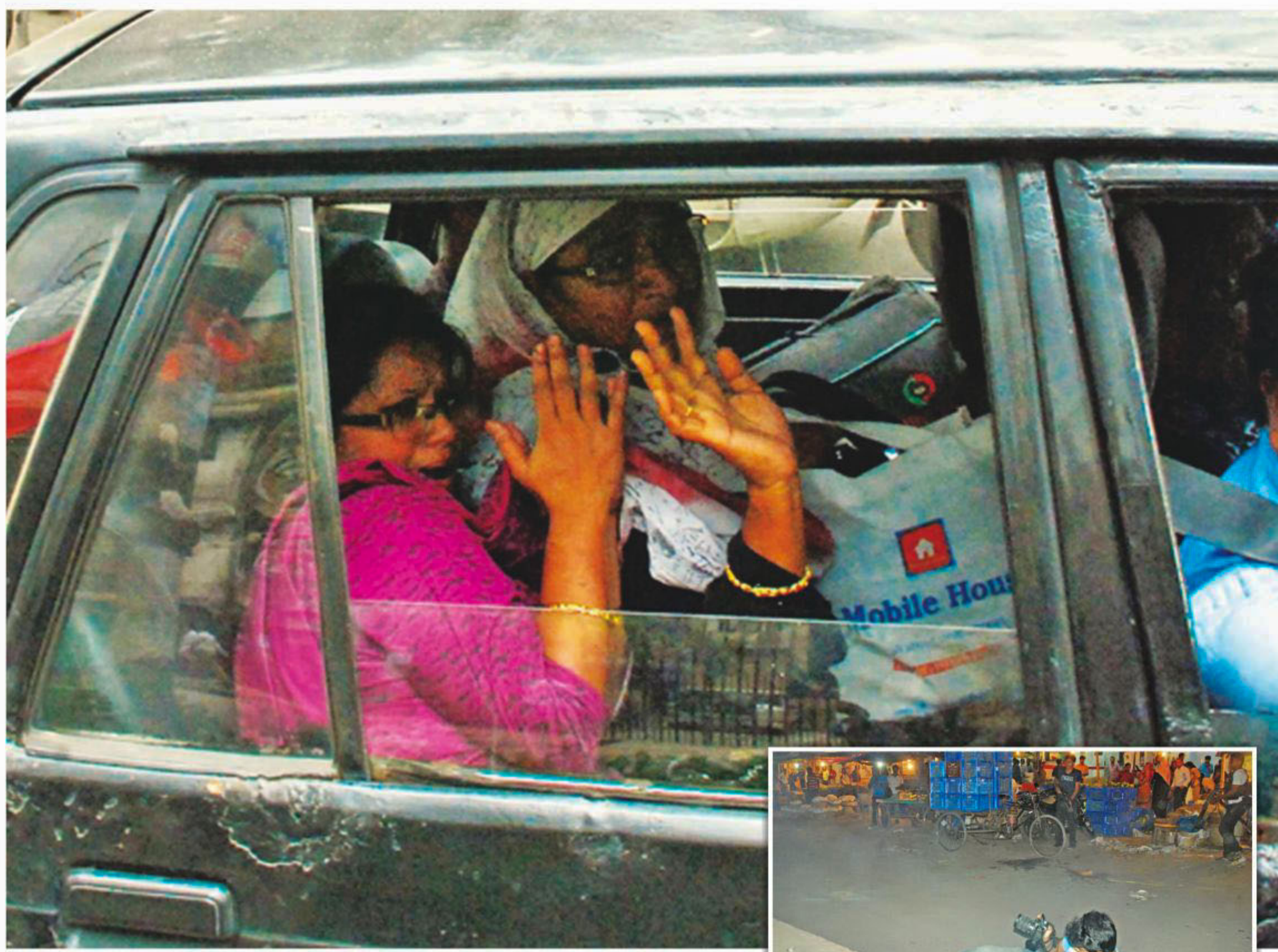
Passengers panic as Islami Chhatra Shibir activists hurl brick chips at vehicles yesterday. Inset, a photojournalist, shot in police firing during a Shibir procession, is knocked to the ground in Rajshahi.