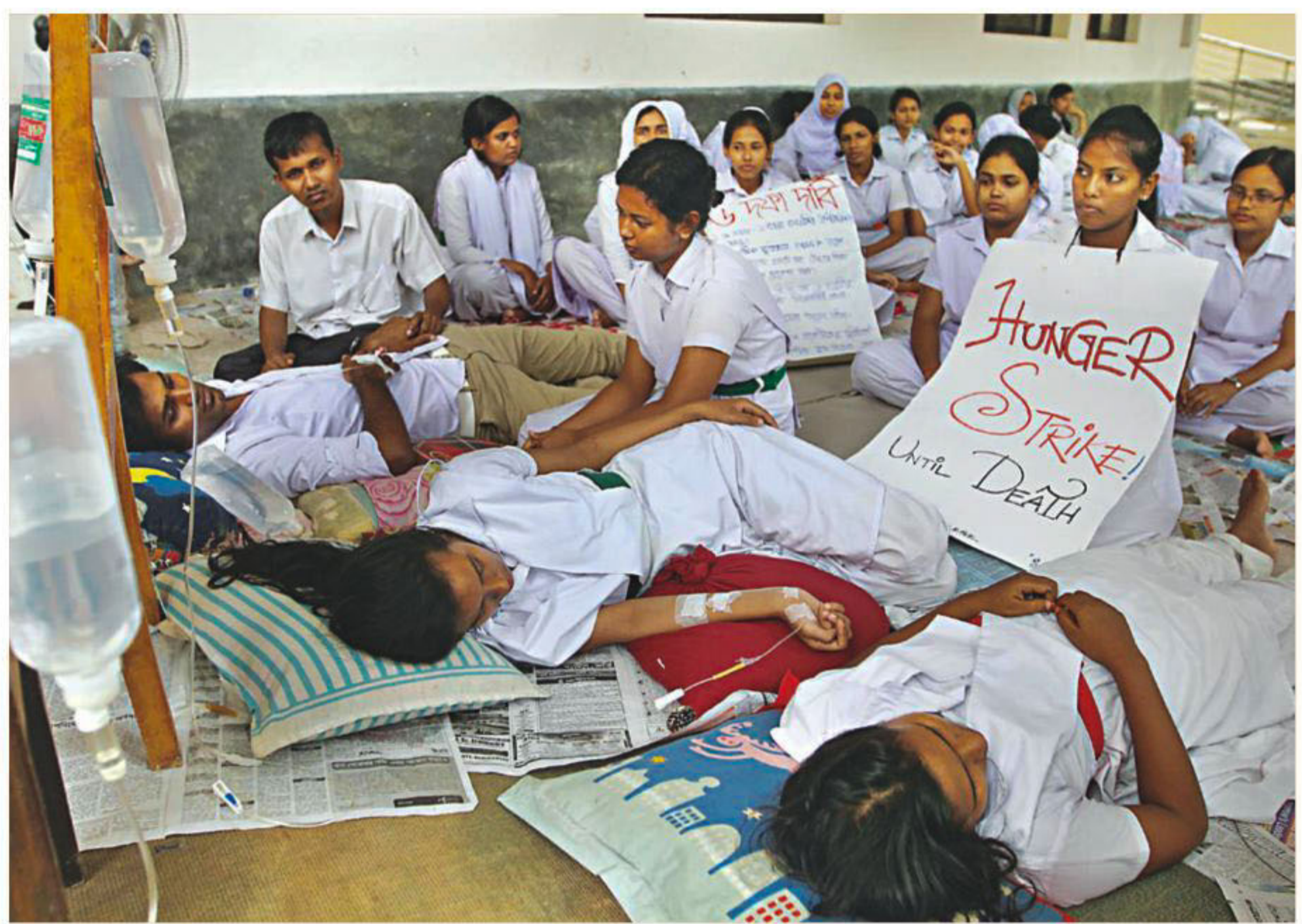
Some students of Chittagong Nursing College on the campus being given saline as they fell sick yesterday on the second consecutive day of their fast-unto-death to realise a six-point demand.