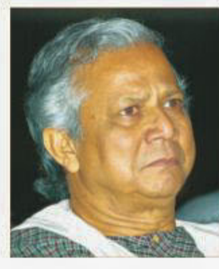
SEE PAGE 2 COL 4

STAFF CORRESPONDENT Yunus Centre yesterday protested Finance Minister AMA Muhith's statement about Grameen Bank and its founder Prof Muhammad Yunus, terming it "completely false". The centre which promotes philosophies of the Nobel laureate made the protest six days after the minister launched a scathing attack on the microcredit pioneer in parliament on June 26. About Muhith's claim that all Grameen social FULL STATEMENT -- PAGE 6