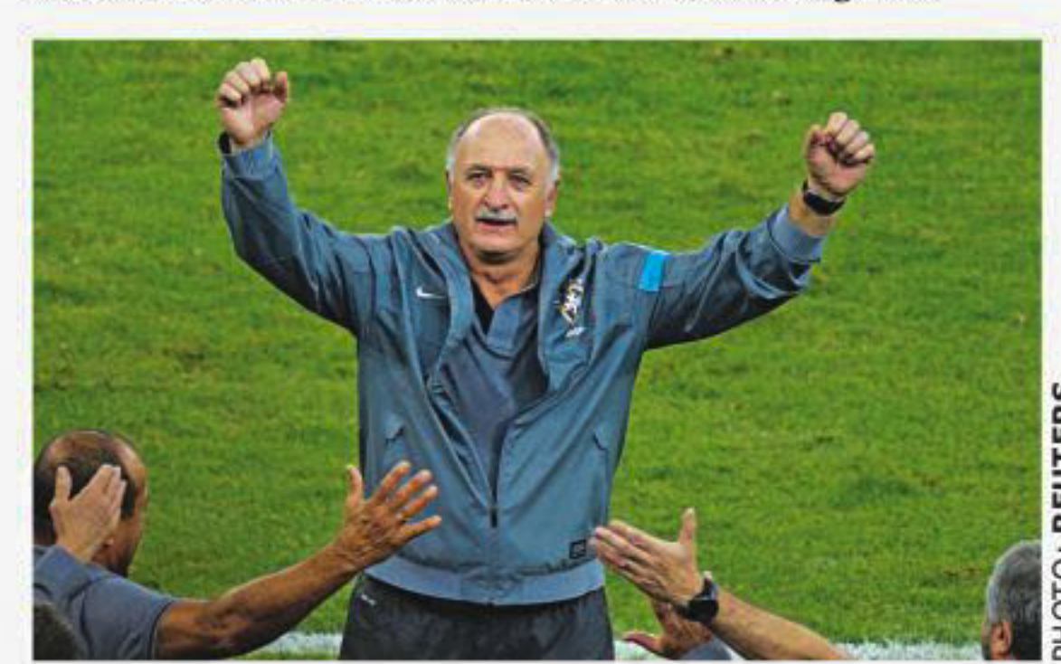
Brazil coach Luiz Felipe Scolari celebrates their victory over Spain in the Confederations Cup final.

The extent to which Brazil now can use the intervening 12 months to oil an even leaner machine in time for their first World Cup hosting since 1950 will be of fascination to students of the international game.