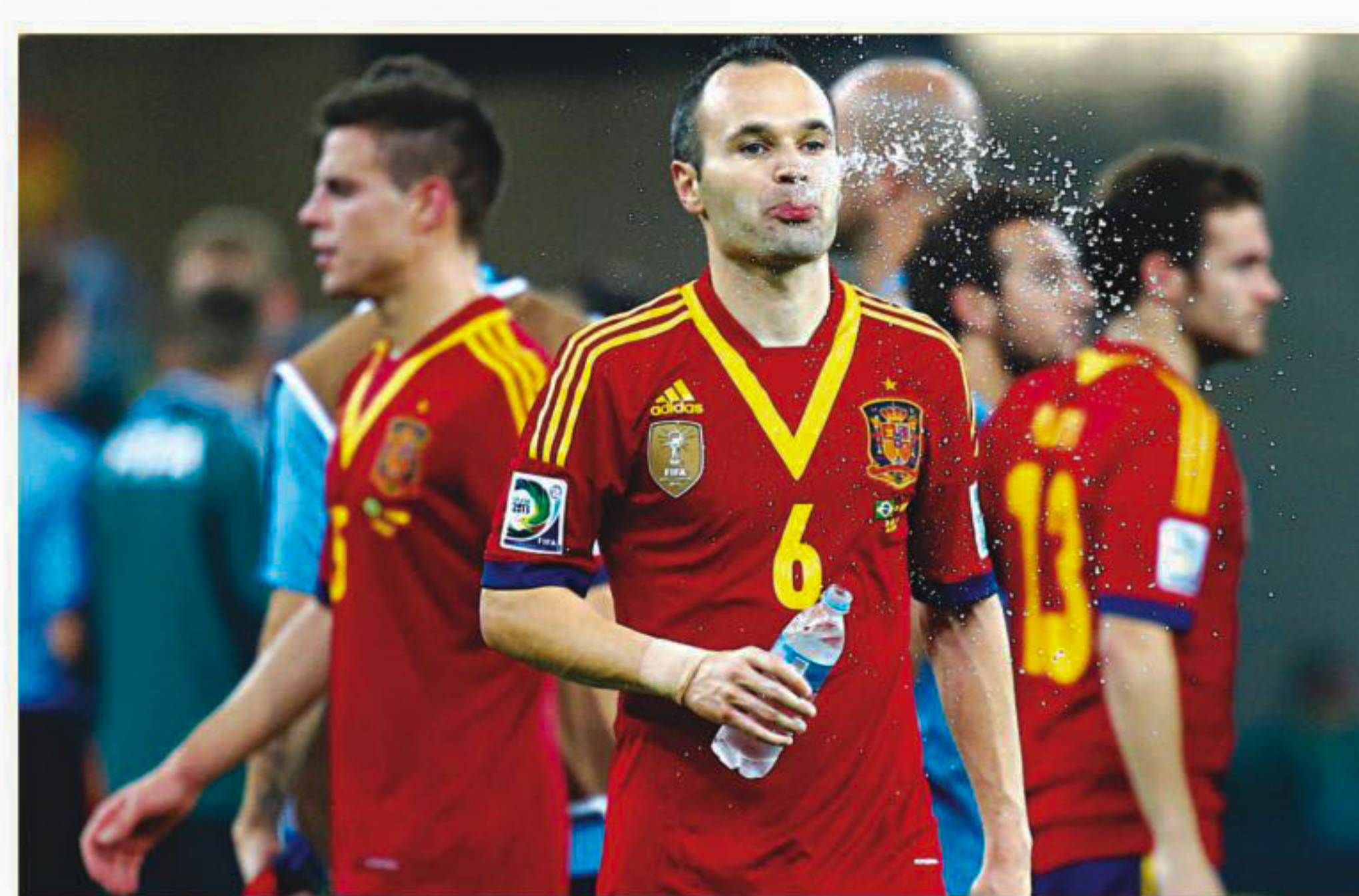
Spain star Andres Iniesta spits water out of his mouth after losing their Confederations Cup final to Brazil.

Rival sports daily AS ran the same defiant front page headline: "We will be back."