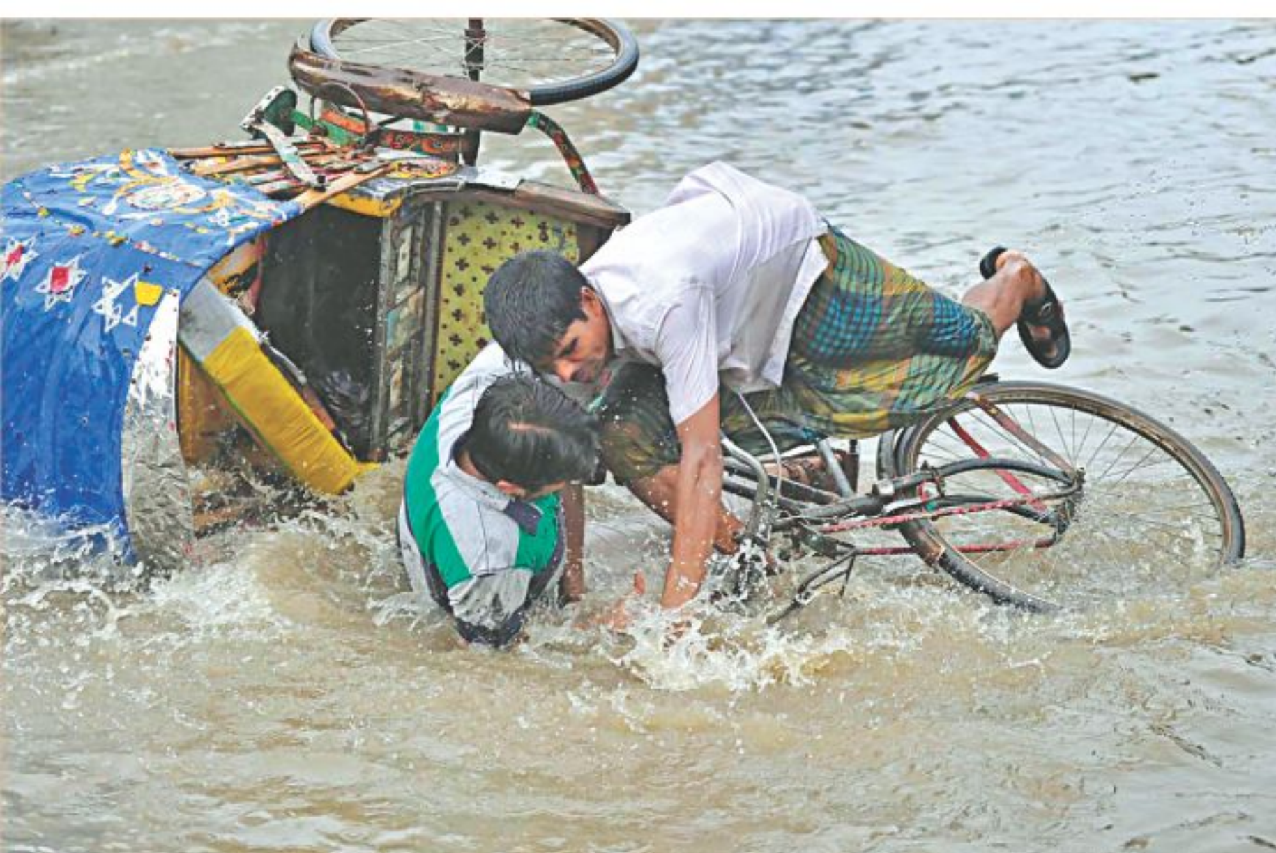
The rickshaw puller and the passenger fall on the waterlogged street near the Arambagh intersection in the capital yesterday afternoon after the rickshaw went into a pothole hidden under water.