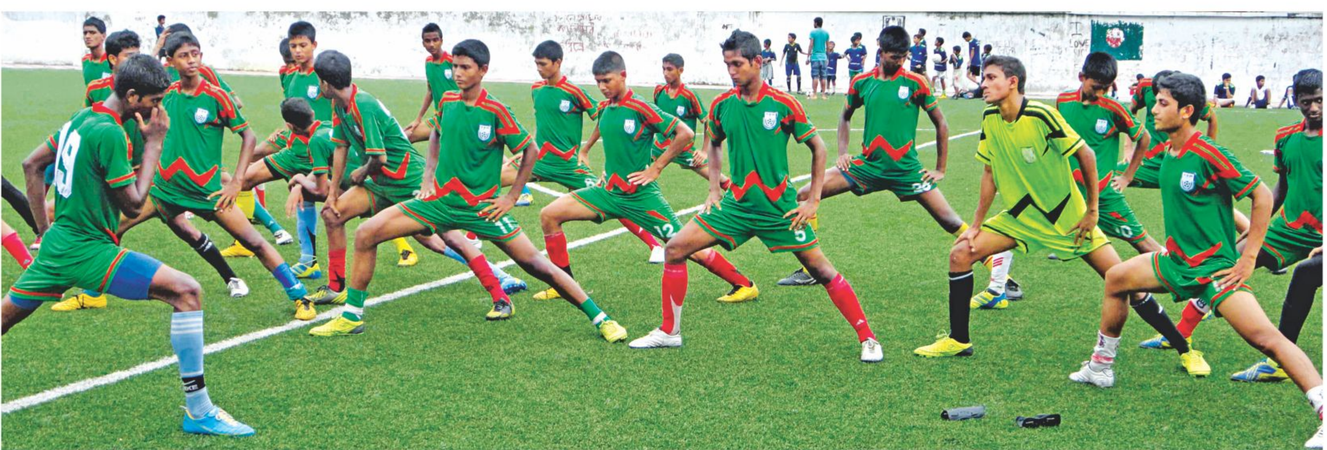
Bangladesh's under-16 footballers stretch during a practice session on the BFF Artificial Turf yesterday, ahead of the SAFF U-16 Championship in Nepal from July 20 to July 30.

While no-one wants to have to return to the sometimes bewildering formulae and calculations necessitated by Duckworth-Lewis, it will be no surprise if batting second and then staying ahead of the par score becomes a priority during the seven matches of this tournament.