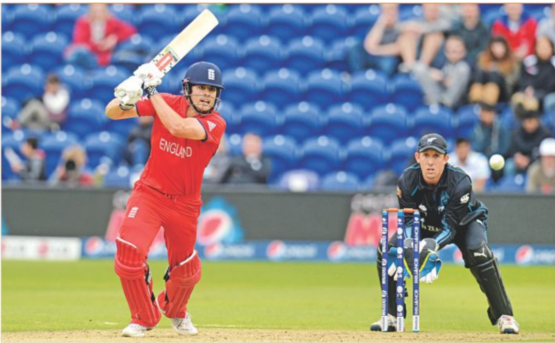
England captain Alastair Cook (L) rode his luck to score 64 against New Zealand in their Champions Trophy match at Cardiff yesterday.

Pietersen told a fan on Twitter on Sunday that he would return to county four-day action for Surrey against Yorkshire on Friday.