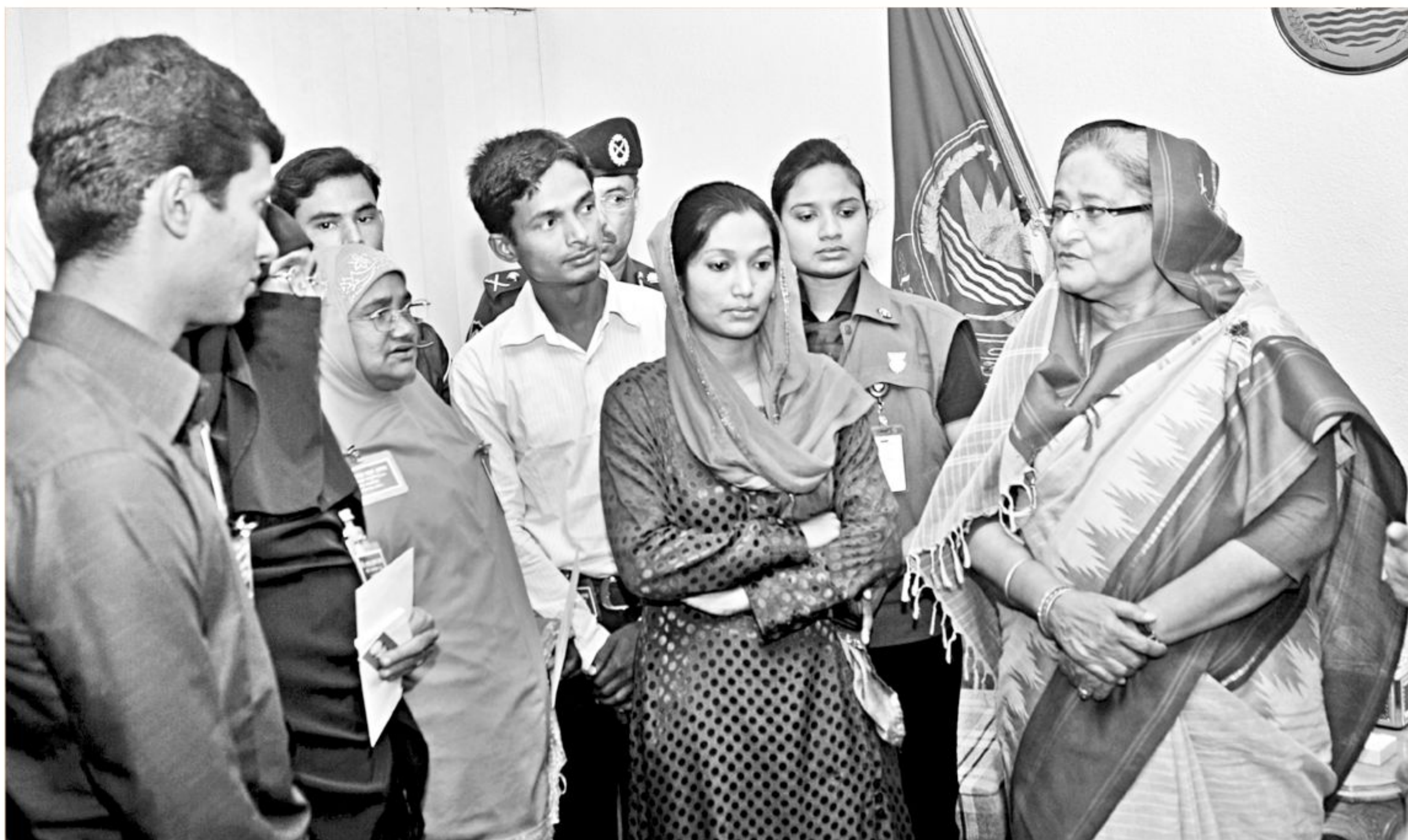
Prime Minister Sheikh Hasina speaks to the family members of three police personnel killed in Hefajat-e Islam violence, after handing over donation cheques to them at her office in the capital yesterday.

Besides, separate child courts will be constituted in district and metropolitan areas.