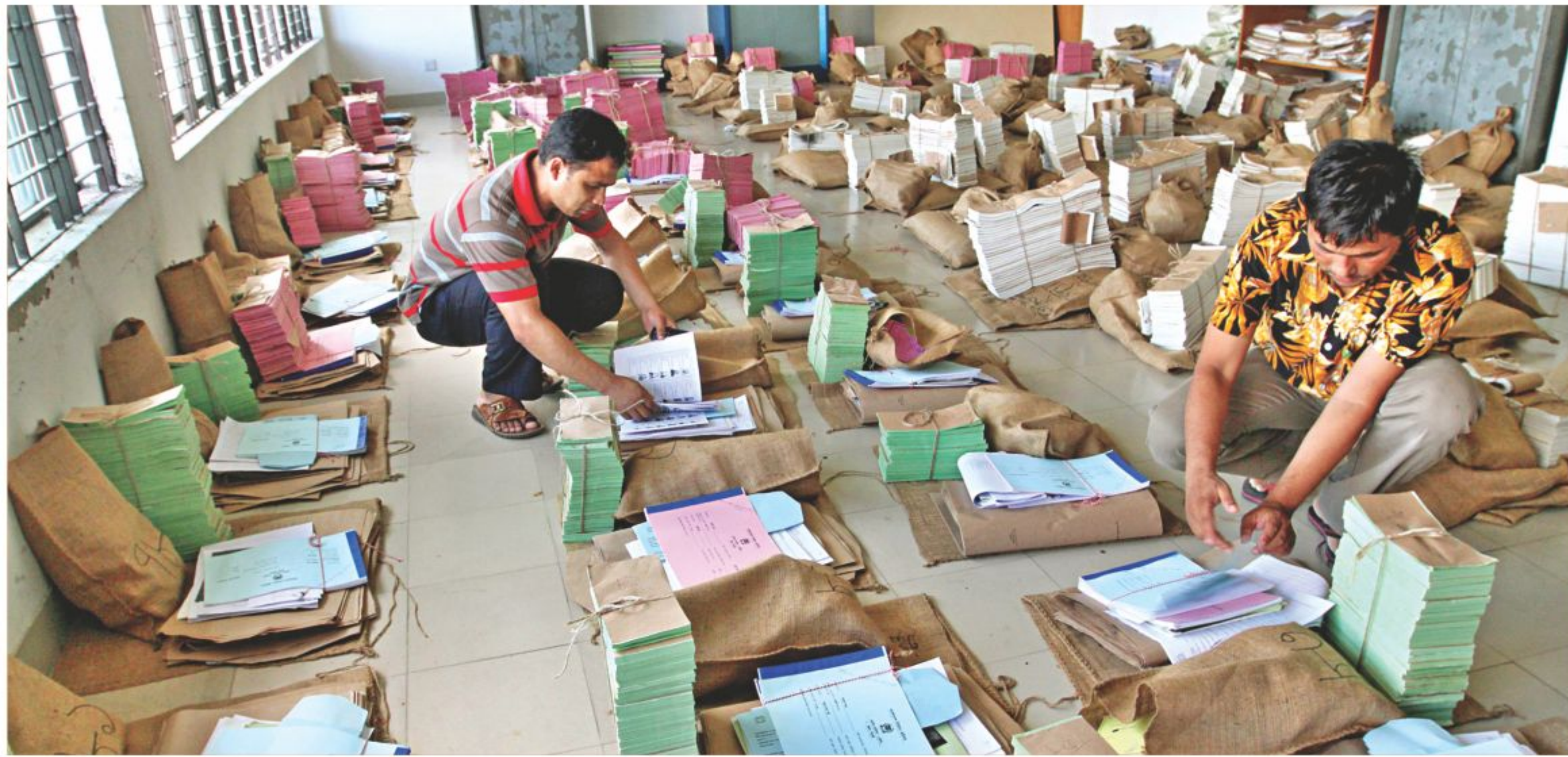
Staff at the Sylhet divisional office of Election Commission yesterday prepare ballot books and other materials necessary for tomorrow's city corporation polls.

Electioneering in the four city corporations, which ended last night, saw last-minute frantic efforts from mayoral and councilor aspirants to woo voters. The cities will be calm today after two weeks of a hectic election campaign. Now, all have to wait till tomorrow morning when voters cast their ballots to decide the fate of the candidates.