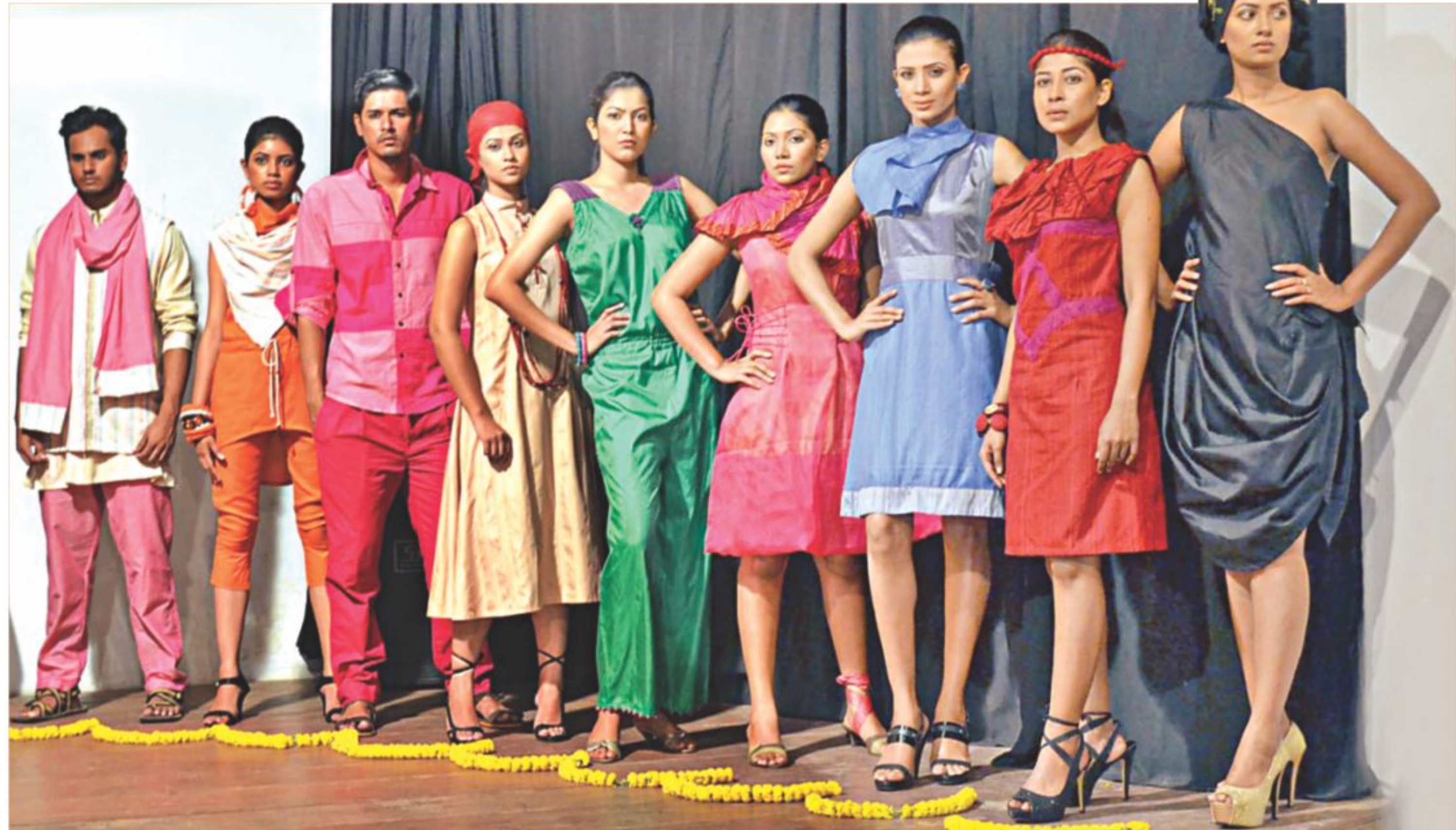
Models sashay down the ramp.