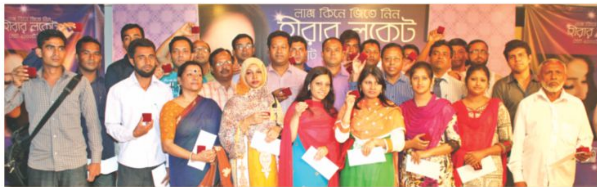
Winners of the campaign pose for a group photo.