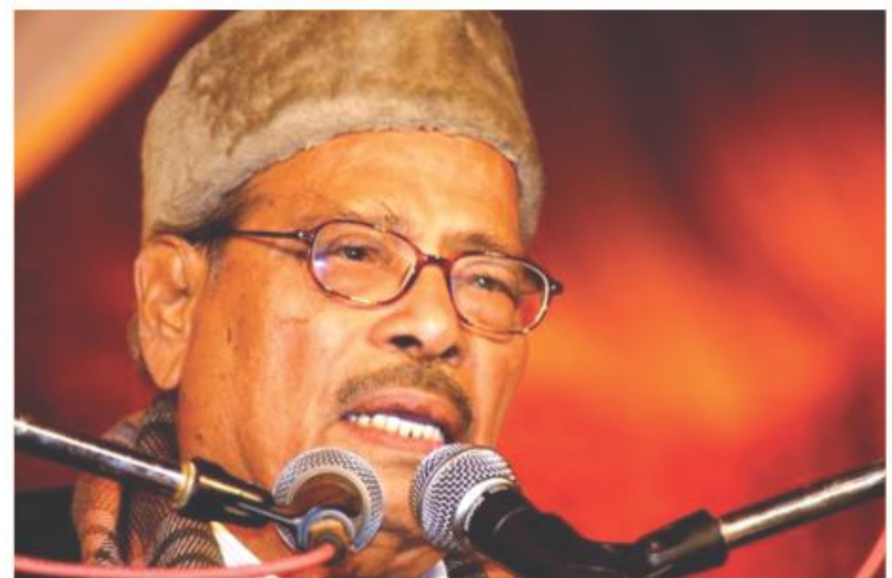
PALLAB BHATTACHARYA, New Delhi

Legendary singer Manna Dey is in a critical but stable condition after being admitted to a hospital in Bangalore city due to a chest infection.