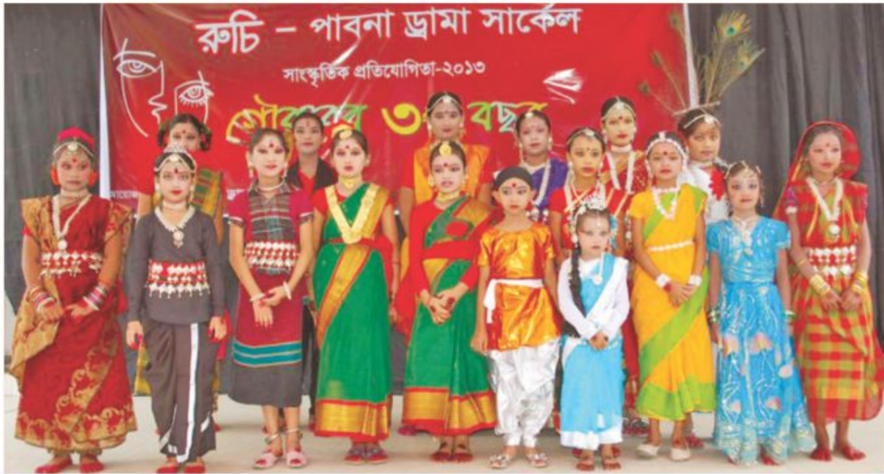
Young participants of the dance competition.

Over 250 children took part in a painting, music and dance festival.