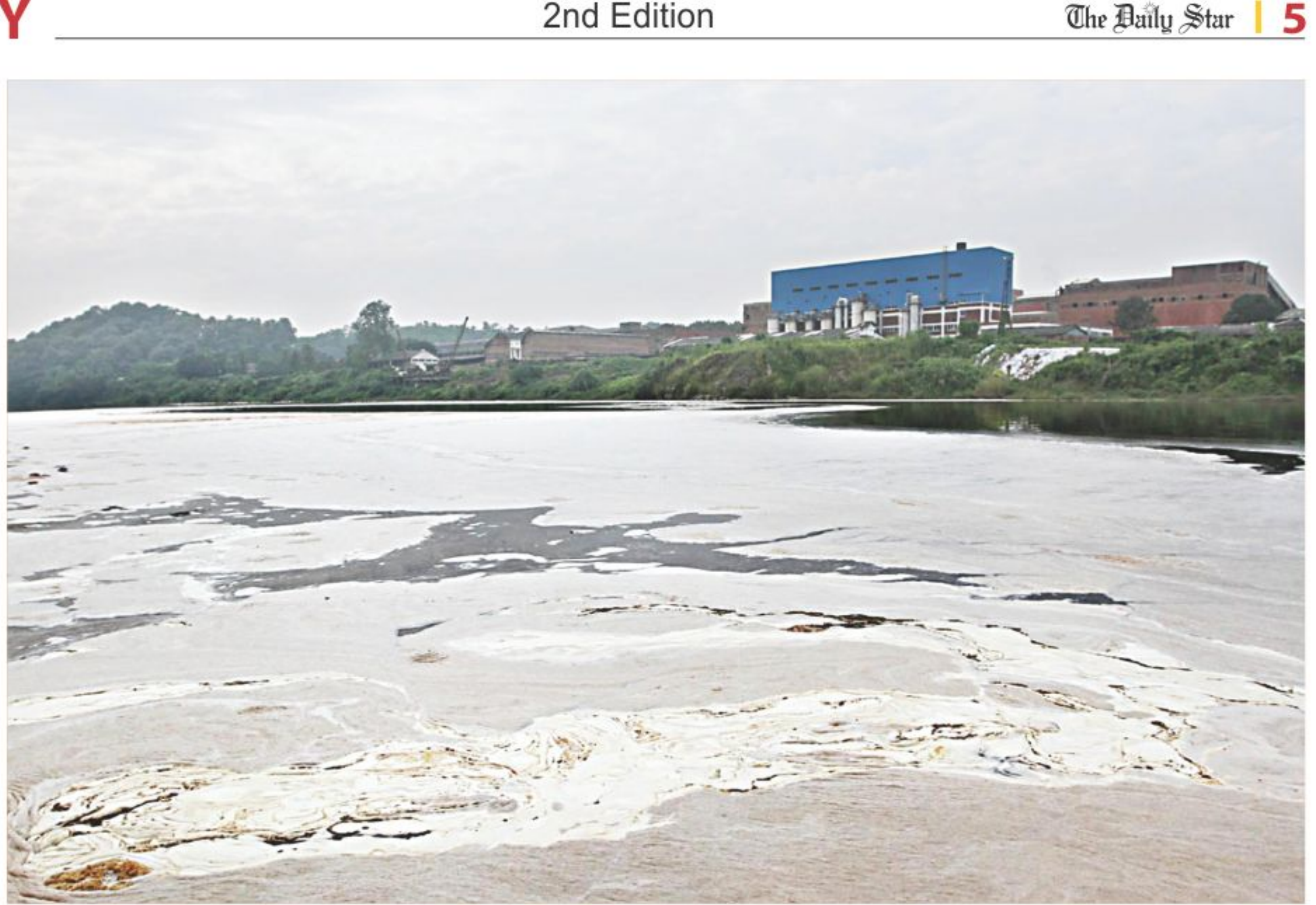
The water of the Karnaphuli River has turned frothy and black due to thousands of tonnes of untreated toxic effluent being discharged from the country's largest and state-owned paper manufacturer Karnaphuli Paper Mills every day. The photo was taken recently from near the mill.

Karnaphuli Paper Mills has been releasing hazardous effluent for 60 years since its inception in 1953. But authorities seem to turn a blind eye to it. Experts warn if the toxic pollution by KPM goes unaddressed, the consequences will be very costly.