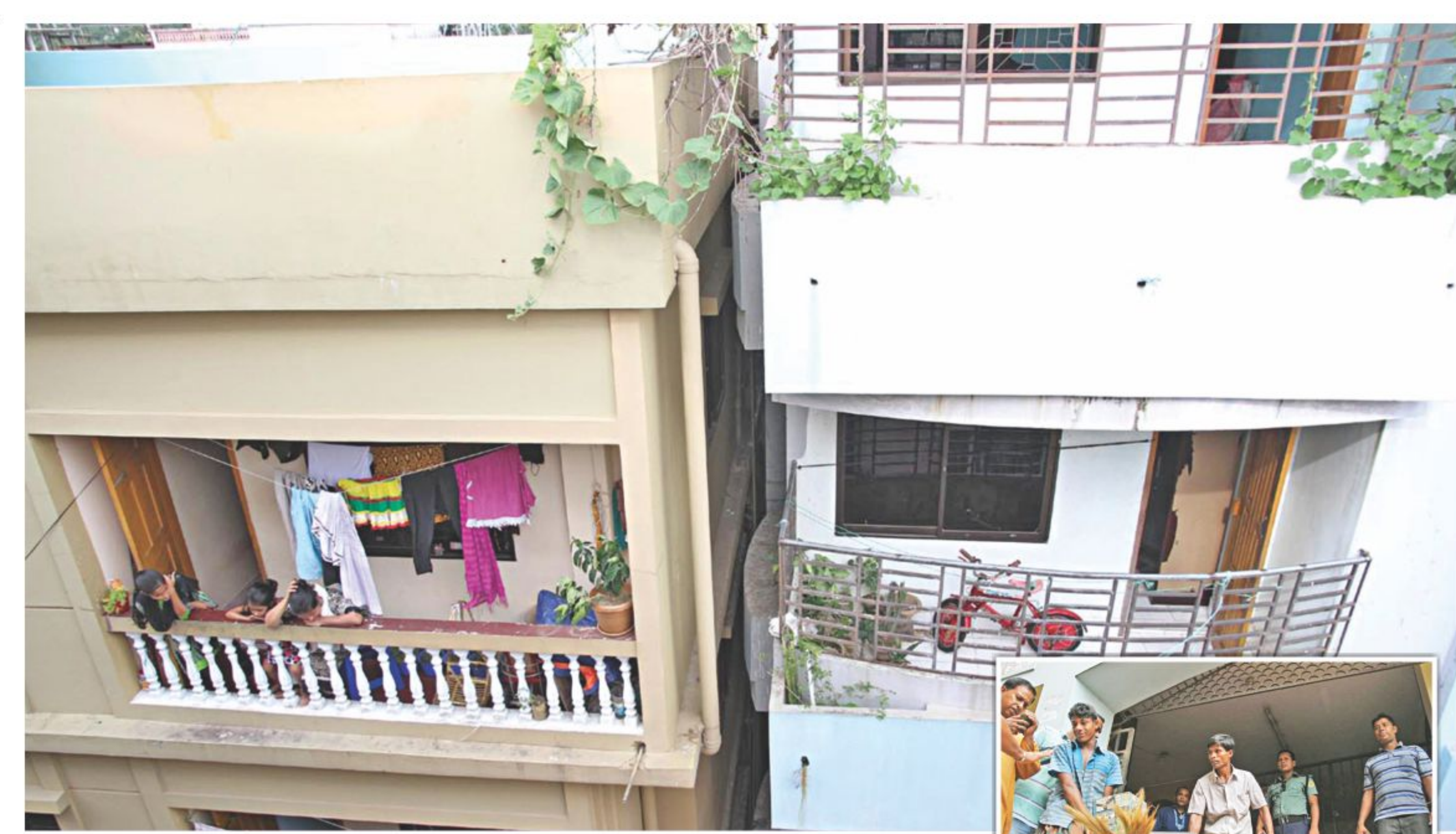
A six-storey building, right, tilted towards the adjoining five-storey building, left, in Shyamoli residential area of Chittagong city yesterday, prompting the Chittagong Development Authority (CDA) to evacuate, inset, both the buildings housing some 18 families.