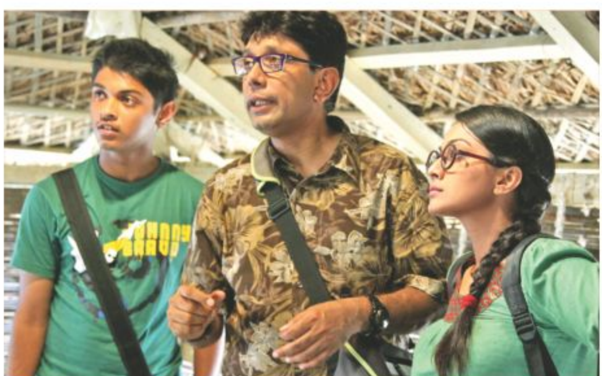
"Cox's Bazar-e Kakatua", Channel i, 7 days, 6:10pm