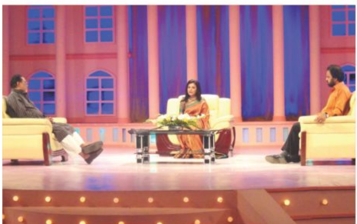
"Humayun Ahmed-er Haate Koyekti Neel-poddo", Banglavisión, Eid day, 9:40pm