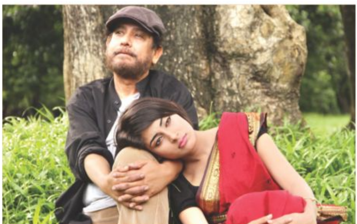
"Baghbondhi - The Mind Game", Desh TV, 7 days, 9pm