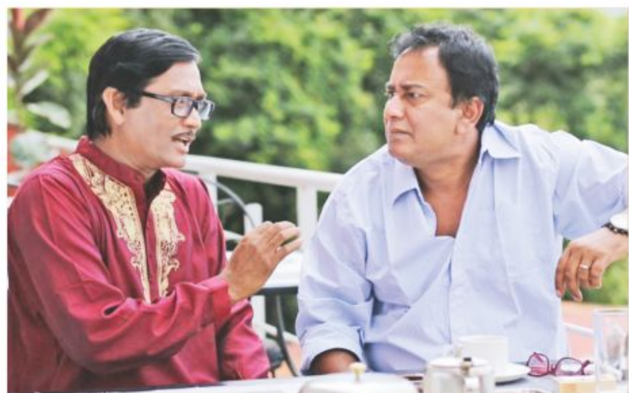
"Sangrila", SA TV, 5 days, 10:30pm