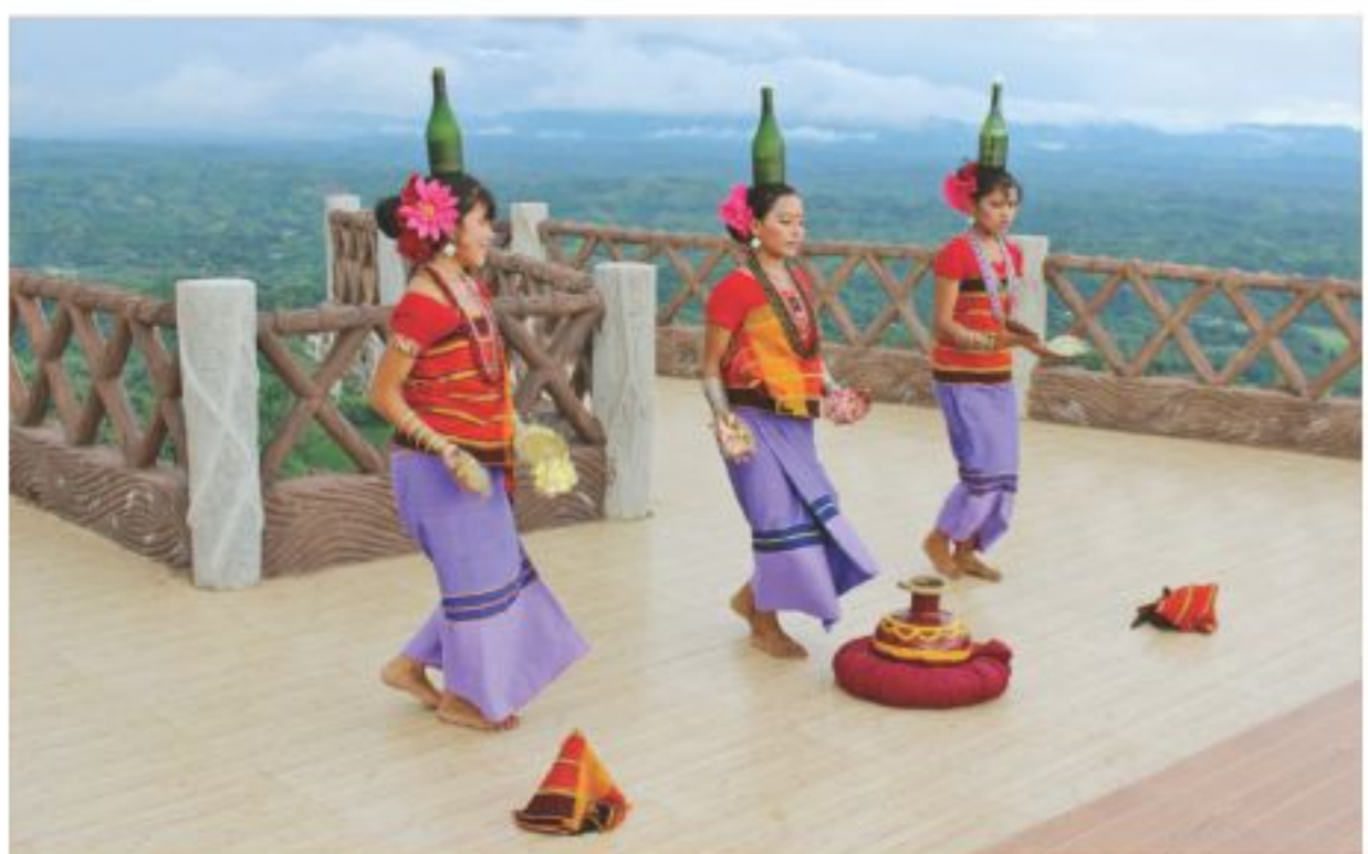
"Neel Paharer Gaye", ETV, Eid day and 5th day, 8:30pm