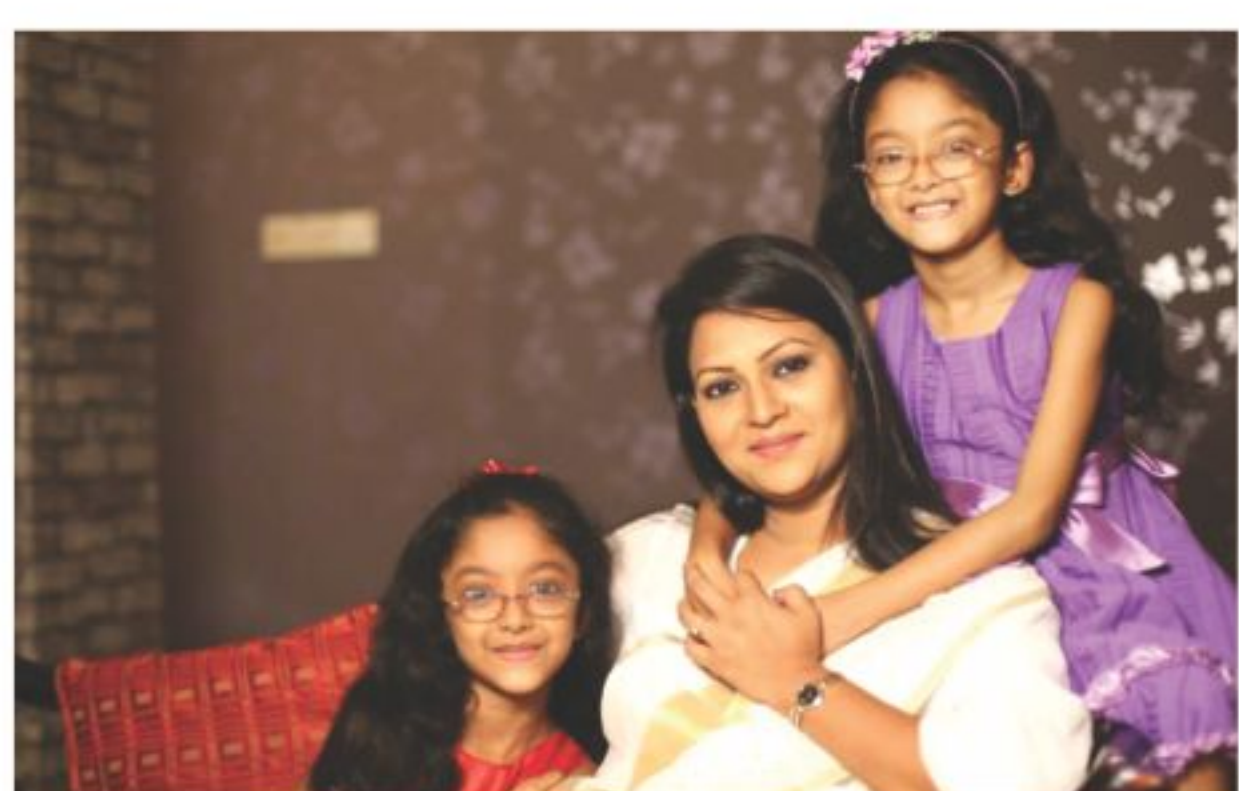
"Ekjon Bhodromohila Othoba Mayer Golpo", Boishakhi TV, Eid day, 11pm