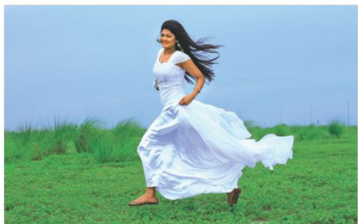
"Rajkonya, Alladin O Doityo", Maasranga Television, 2nd day, 2:30pm