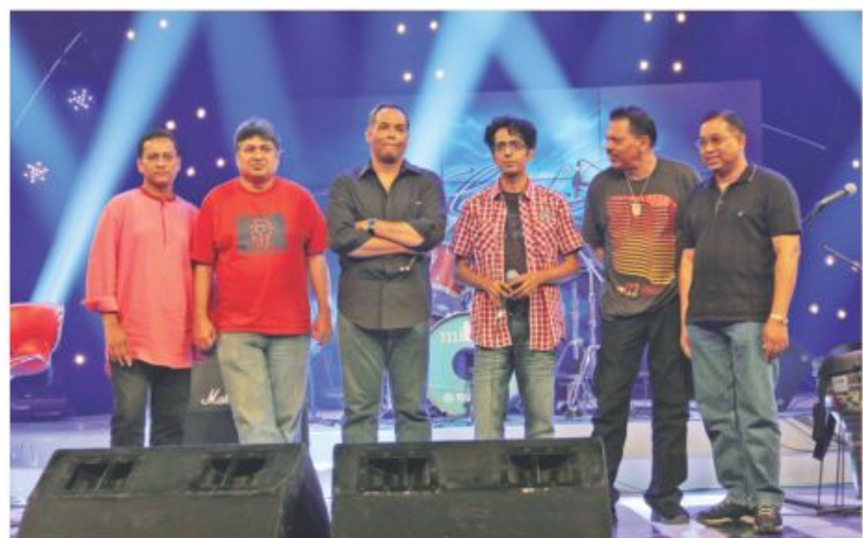
"Club Nine", Channel 9, 3rd day, 9:35pm