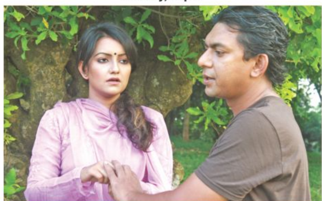
"Foreign Jamai", Rtv, Eid day, 7:10pm