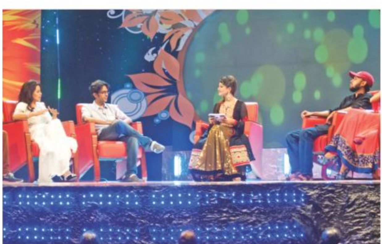
"Single Single Super Star", ATN Bangla, 2nd day, 11:50pm