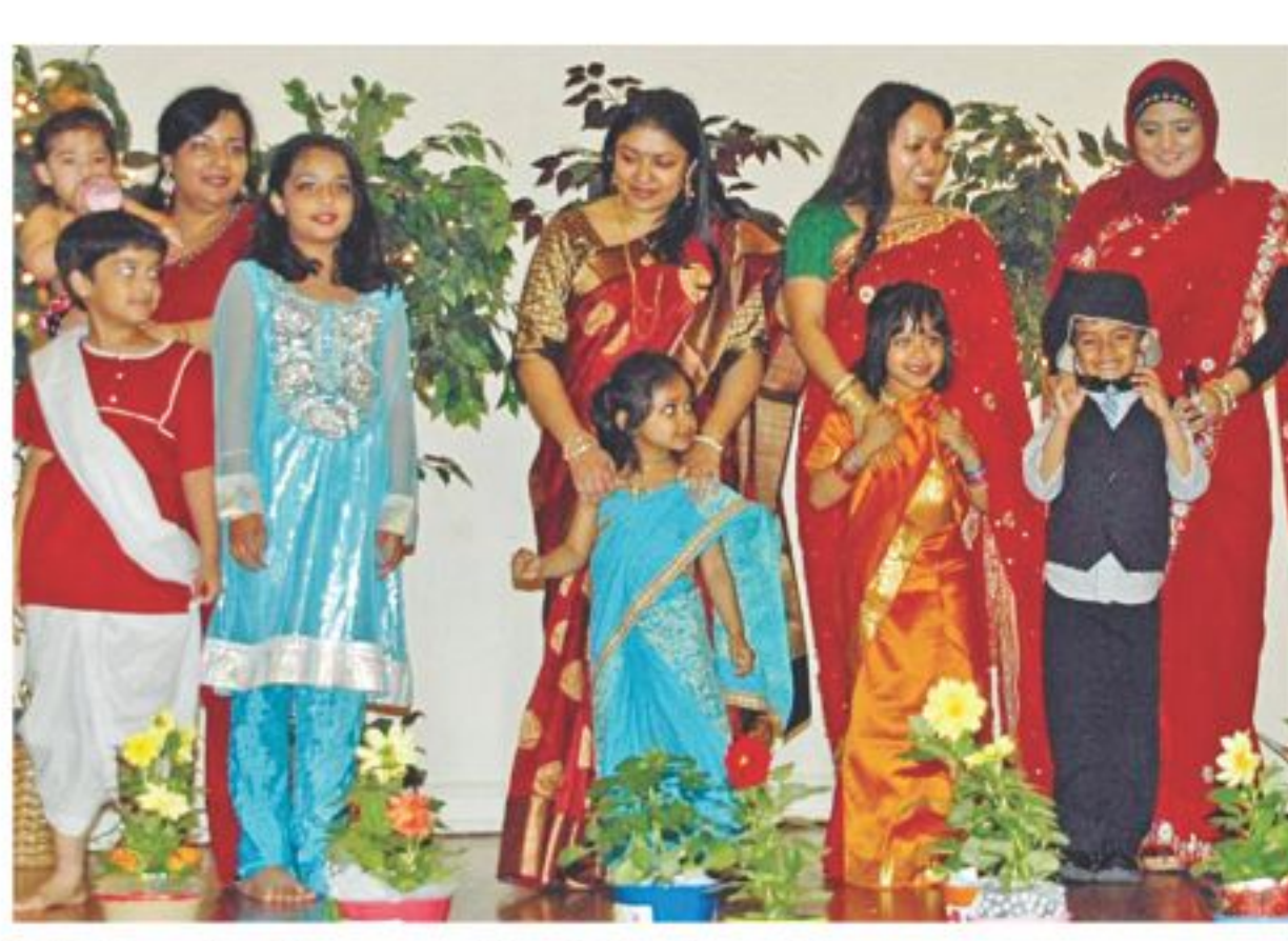
Children in the warmth of their mothers.