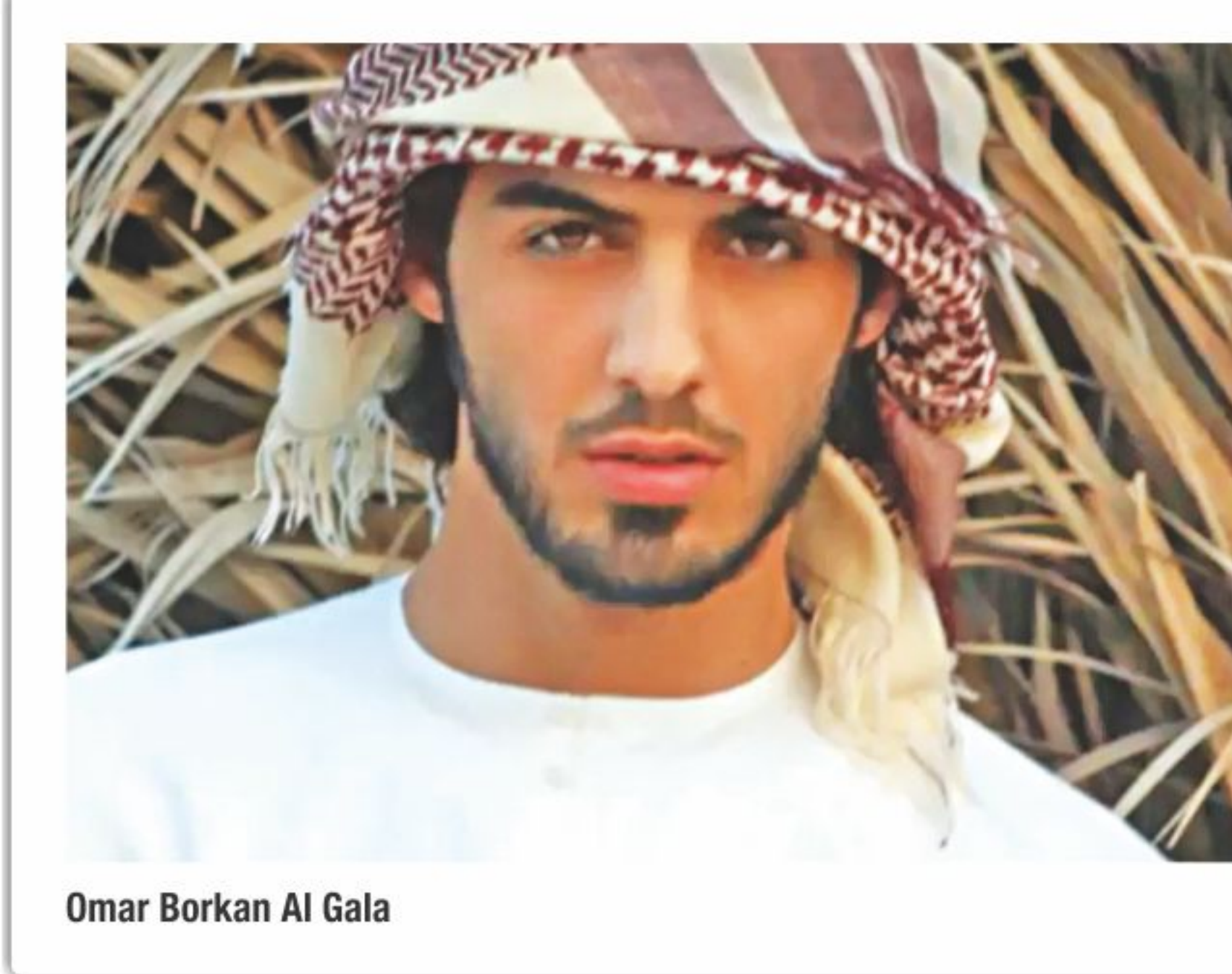
Omar Borkan Al Gala