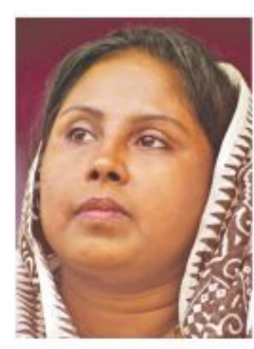
SEE PAGE 10 COL 1