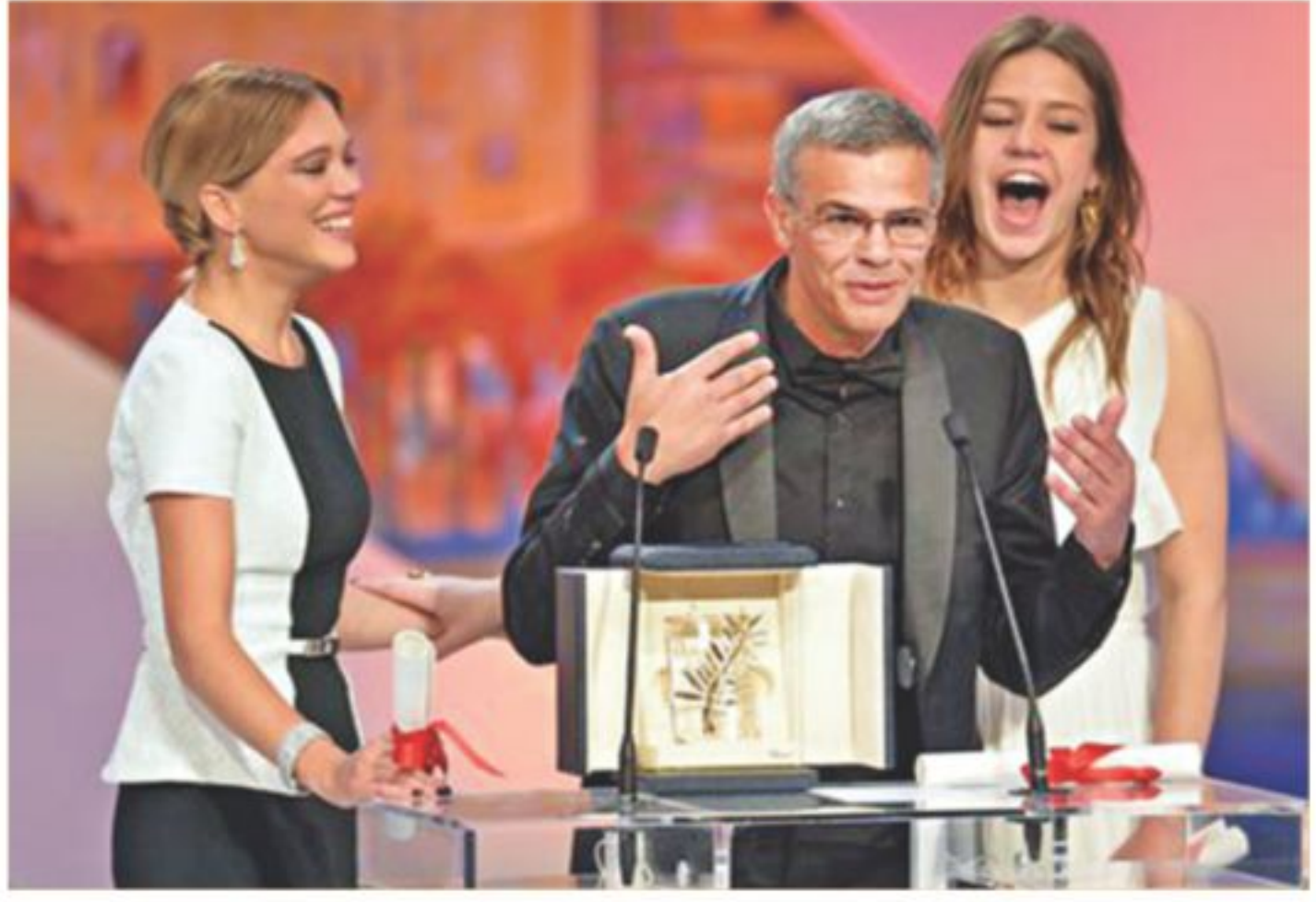
(From left) Actress Lea Seydoux, director Abdellatif Kechiche and actress Adele Exarchopoulos ecstatic on stage after "Blue is the Warmest Colour" received the Palme d'Or in Cannes.

"Blue is the Warmest Colour" ("La Vie d'Adele"), an intimate love story about two young French women, has won the Palme d'Or for best film at the Cannes Film Festival. It has attracted attention for bold scenes, as well as the acclaimed performances of actresses Adele Exarchopoulos and Lea Seydoux. Hollywood veteran Bruce Dern won best actor for his performance in Nebraska, while French star Berenice Bejo -- known for silent film "The Artist" -- won best actress for her role in "The Past". The winners were picked from the 20 films in competition and were named at the festival's closing ceremony on Sunday. "Blue is the Warmest Colour" is a three-hour coming-of-age movie in which Exarchopoulos plays a 15-year-old who falls in love with an older woman, played by Seydoux. Directed by Abdellatif Kechiche, it won rave reviews in Cannes, being described as "epic yet intimate" by The Guardian. But it also shocked some critics. The Hollywood Reporter said the "sprawling drama" would "raise eyebrows" as it crossed the barrier "between performance and the real deal." Some had questioned whether some scenes may make it too explicit for the top prize. But director Steven Spielberg, who chaired the jury, told reporters: "I think it will get a