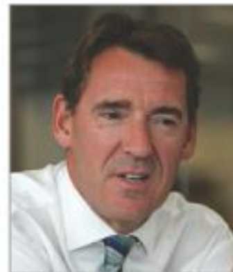
Jim O'Neill, Former Chairman Goldman Sachs Asset Management & Former Chief Economist Goldman Sachs

JOIN INVESTORS & KEYNOTE SPEAKERS INCLUDING JIM O'NEILL - Creator of the BRICS and N-11