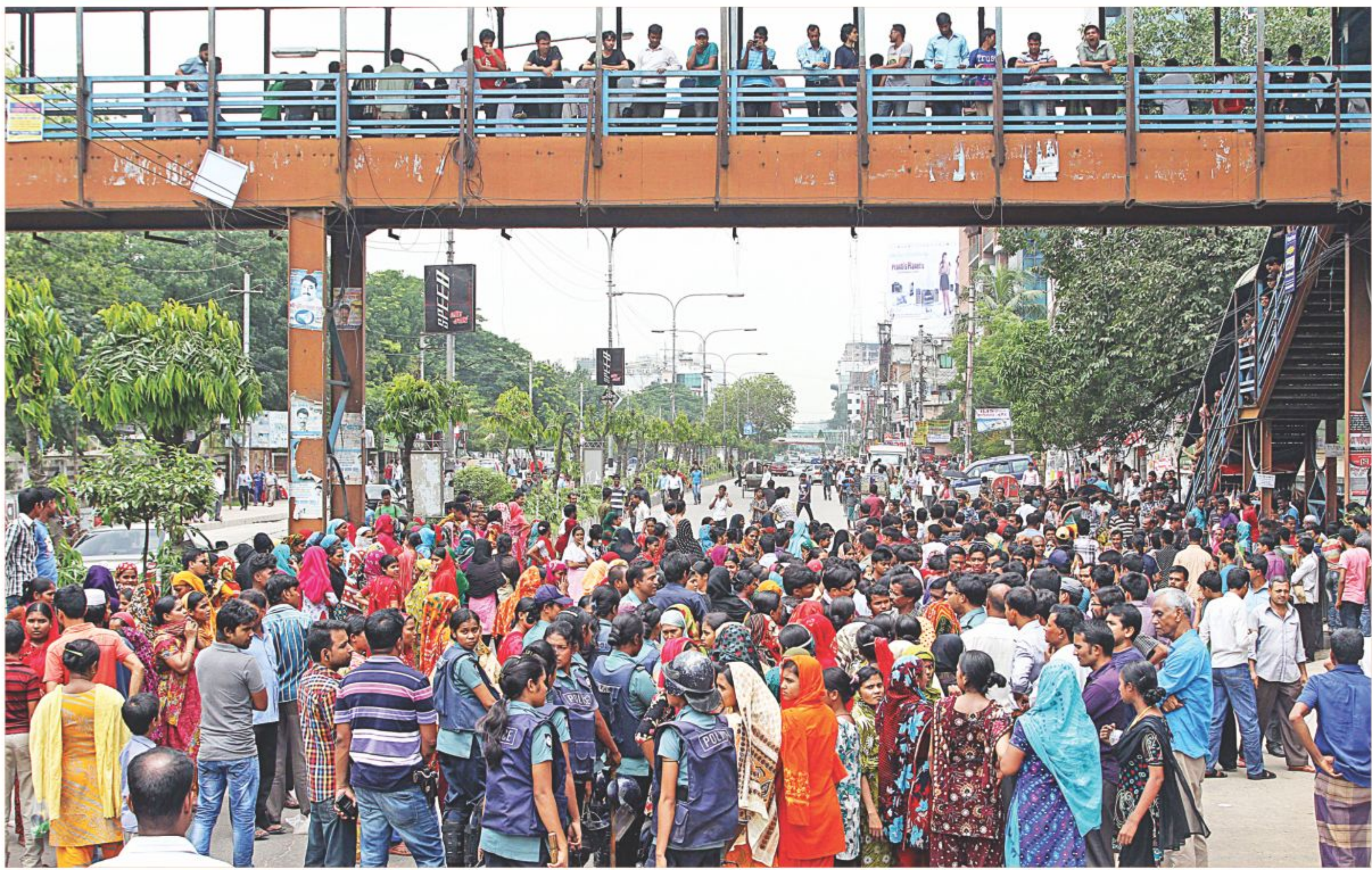
Workers of Bashundhara Garments Limited block half of Mirpur Road near Kalabagan Bus Stand in the capital yesterday protesting the shifting of a unit to a new location in Savar. (Story on B1)