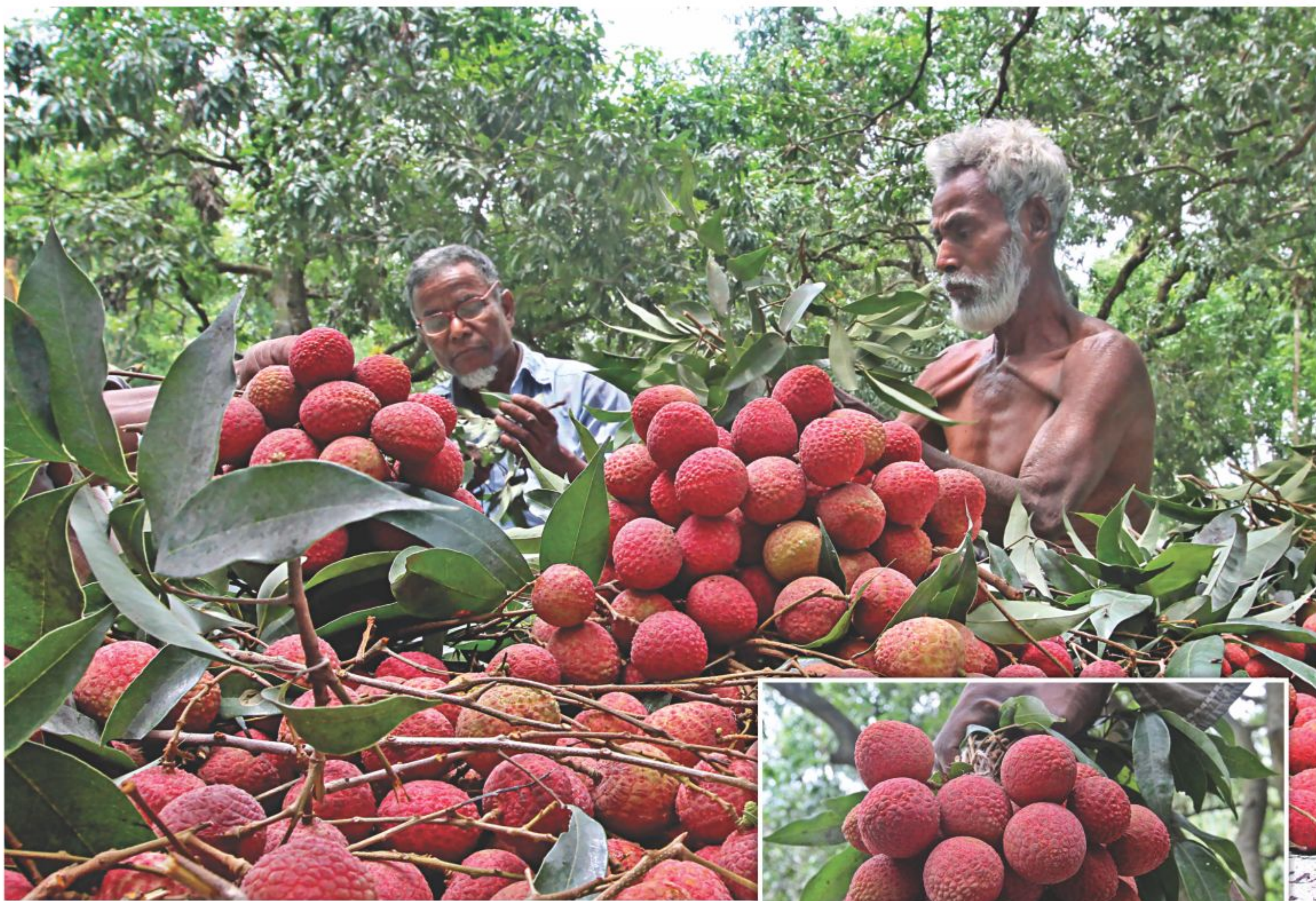
Lichi farmers harvest the summer fruit at their orchard in Birampur of Dinajpur. Lichis are usually available in the market for a short period, but this year early harvest has already made them available in the capital's markets. The prices of the fruit vary between Tk 200 and Tk 800 per 100 depending on variety.