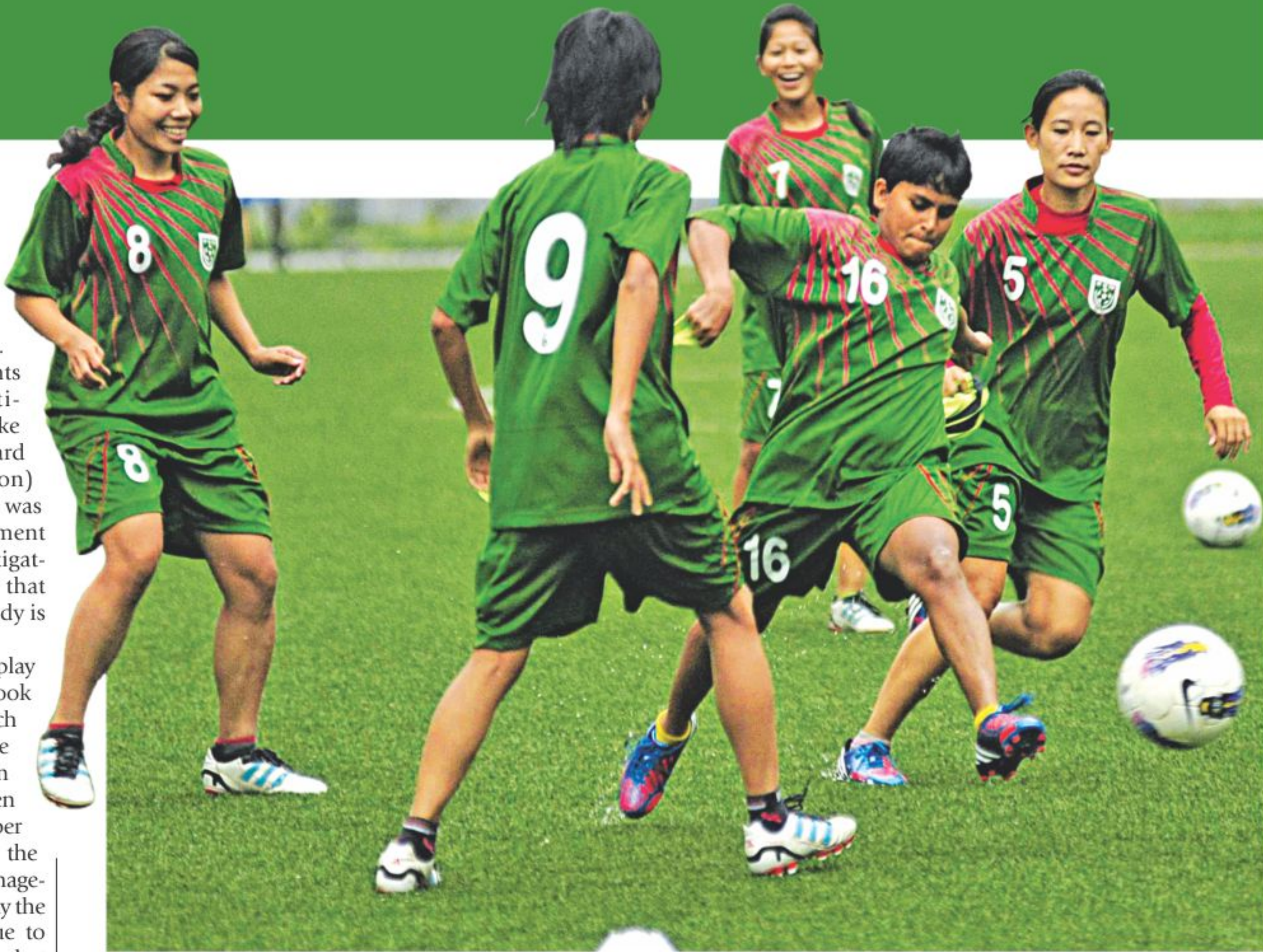
The Bangladesh national women's team's booters practice at the astro-turf adjacent to the BFF House yesterday, ahead of today's AFC Asian Women's Cup qualifier against Philippines.

Result: Mumbai won by 4 wickets MoM: Harbhajan Singh