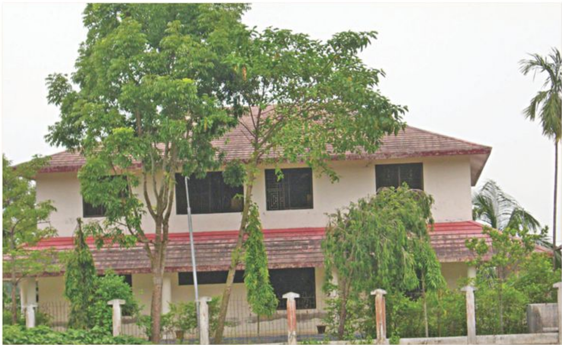
The Nazrul memorial centre in Kazir Shimla.