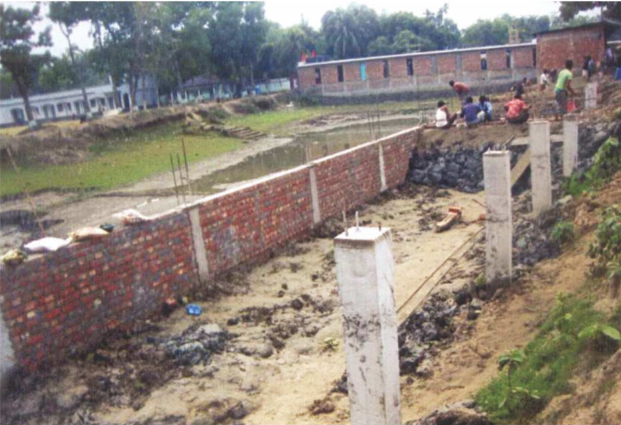
Authorities of Bidyaganj Rani Rajbala Bahumukhi High School in Mymensingh Sadar upazila have continued construction of a market, filling up a good portion of the decades' old pond on the school compound.