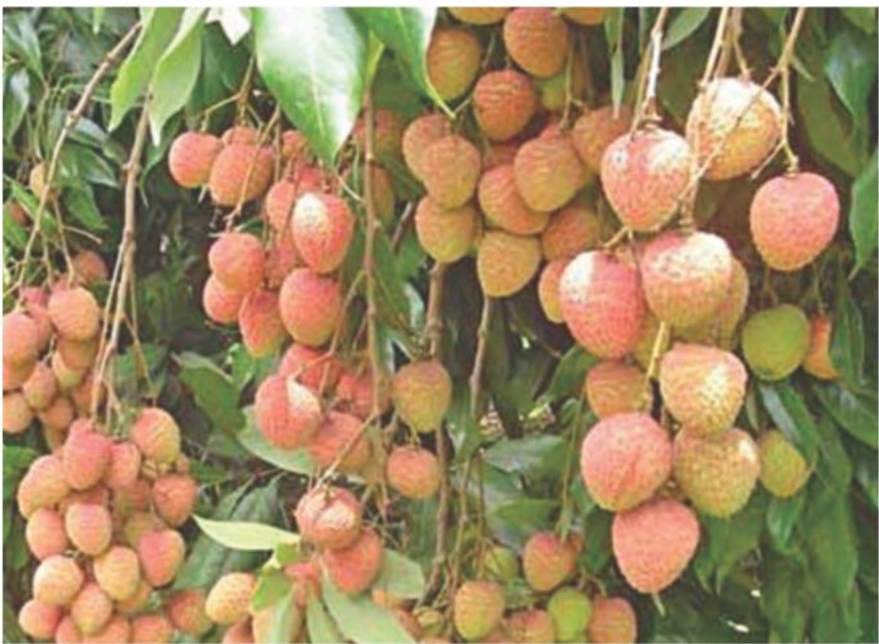
A litchi orchard at Salimpur village under Ishwardi upazila of Pabna is full of ripe or nearly ripe juicy summer fruits. Farmers in the upazila expect bumper yield of litchi as well as good business this year.