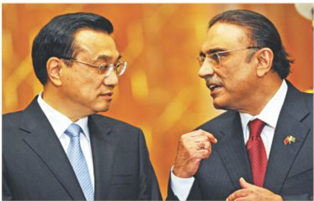
Li Keqiang and Asif Ali Zardari

Chinese Premier Li Keqiang yesterday vowed to strengthen his country's partnership with Pakistan as he arrived for a visit less than two weeks after the country's general election. The long-time allies will look to use the two-day trip to boost trade ties, and Li will meet prime minister-elect Nawaz Sharif -- who has not yet been sworn in -- as well as holding talks with senior officials. Sharif's Pakistan Muslim League-N (PML-N) party swept to victory in the May 11 general election on a promise to revitalise the struggling economy. Help from its giant northern neighbour will be important to this. Trade between China and Pakistan hit an annual $12 billion for the first time last year, according to Islamabad's foreign ministry, and the two sides plan to raise this to $15 billion in the next two to three years. Li, arriving from India on his first overseas tour as premier, was met by President Asif Ali Zardari on the tarmac at Nur Khan air base in Rawalpindi next to Islamabad.