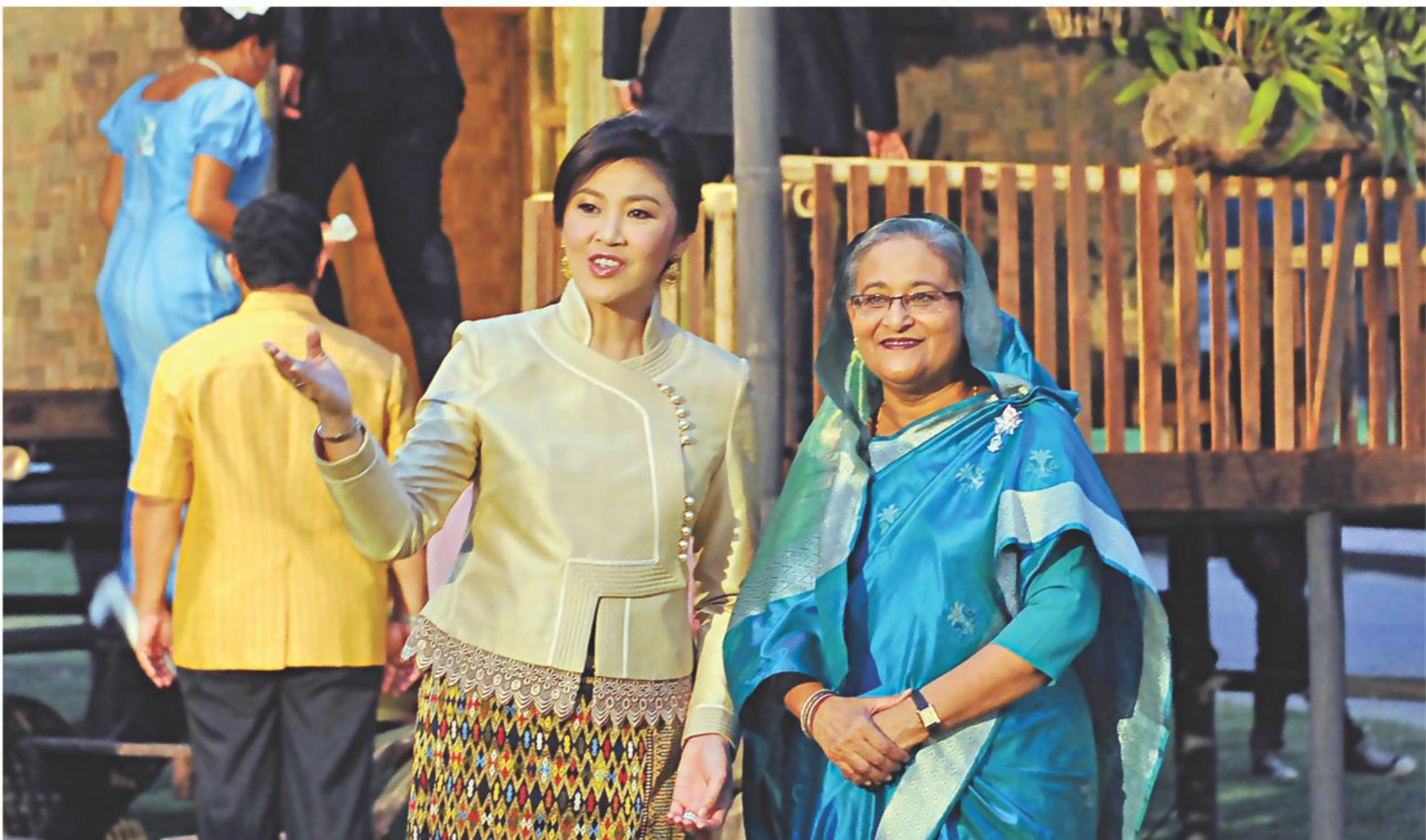
Thai Prime Minister Yingluck Shinawatra welcomes her Bangladeshi counterpart Sheikh Hasina at the Wiang Kum Kum in Chiang Mai of Thailand yesterday.