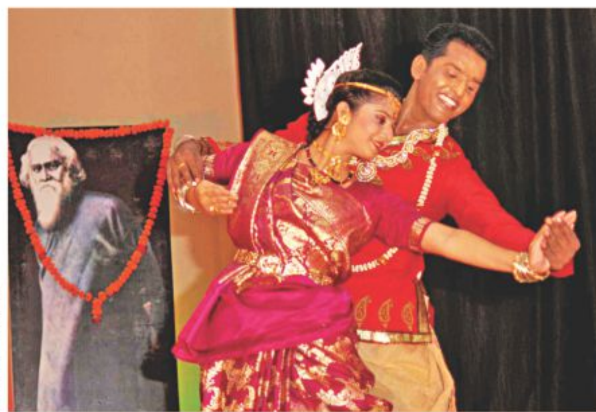
Artistes perform at the programme in Bogra.