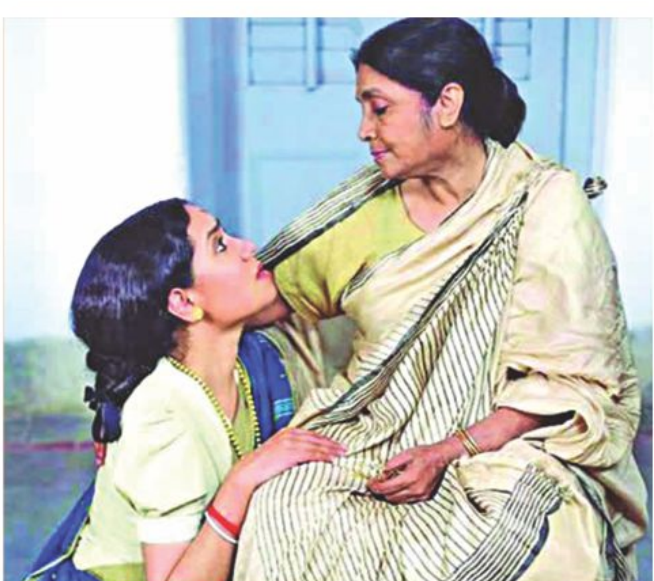
Tropa with mom and dad; on and off camera.