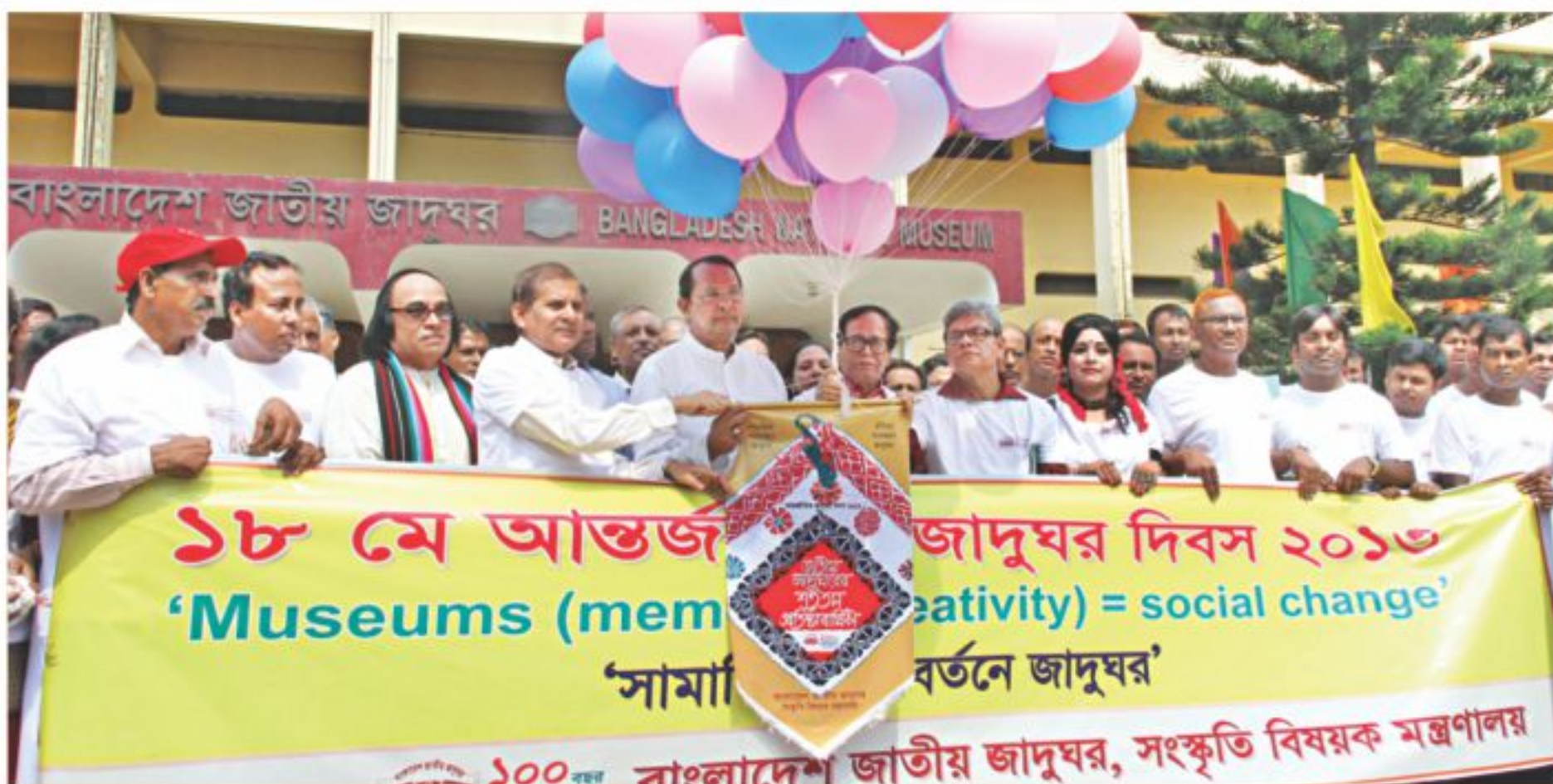
Guests at the rally marking International Museum Day.