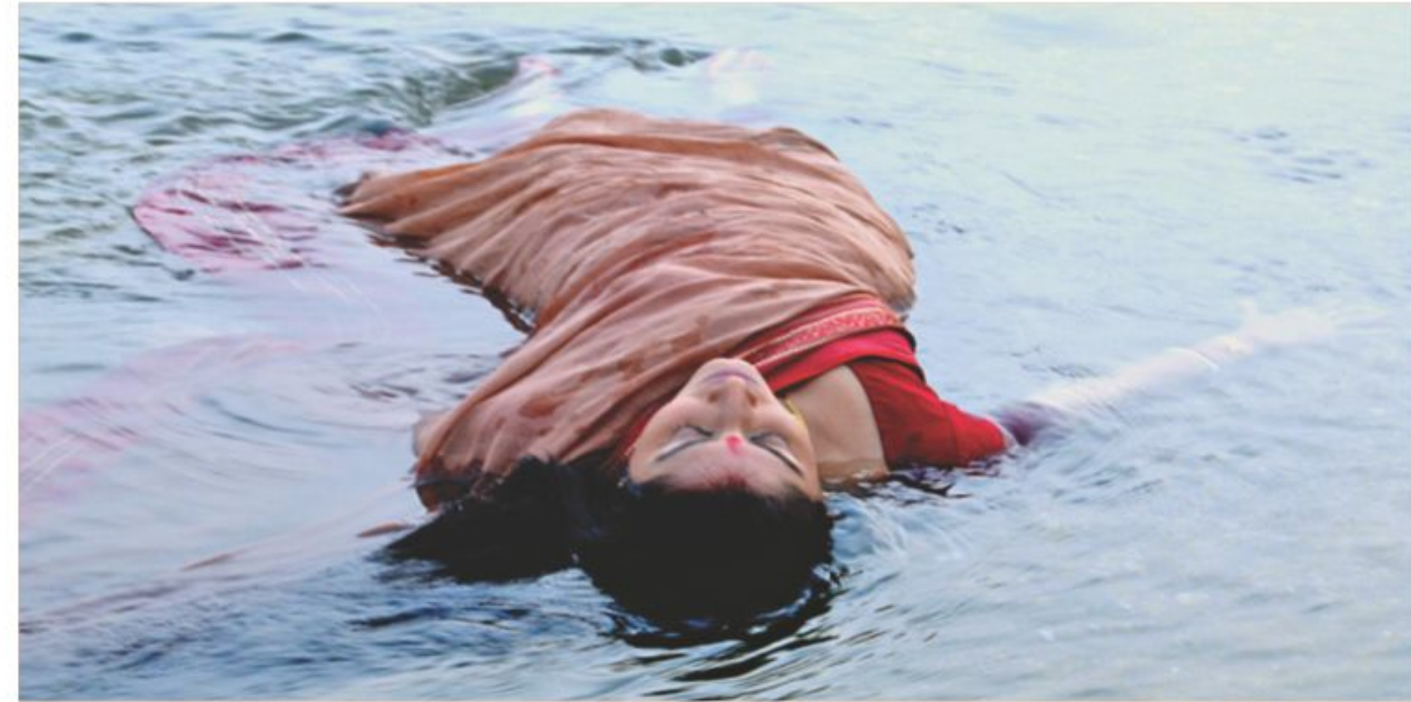
A scene from “Banshiwala”.