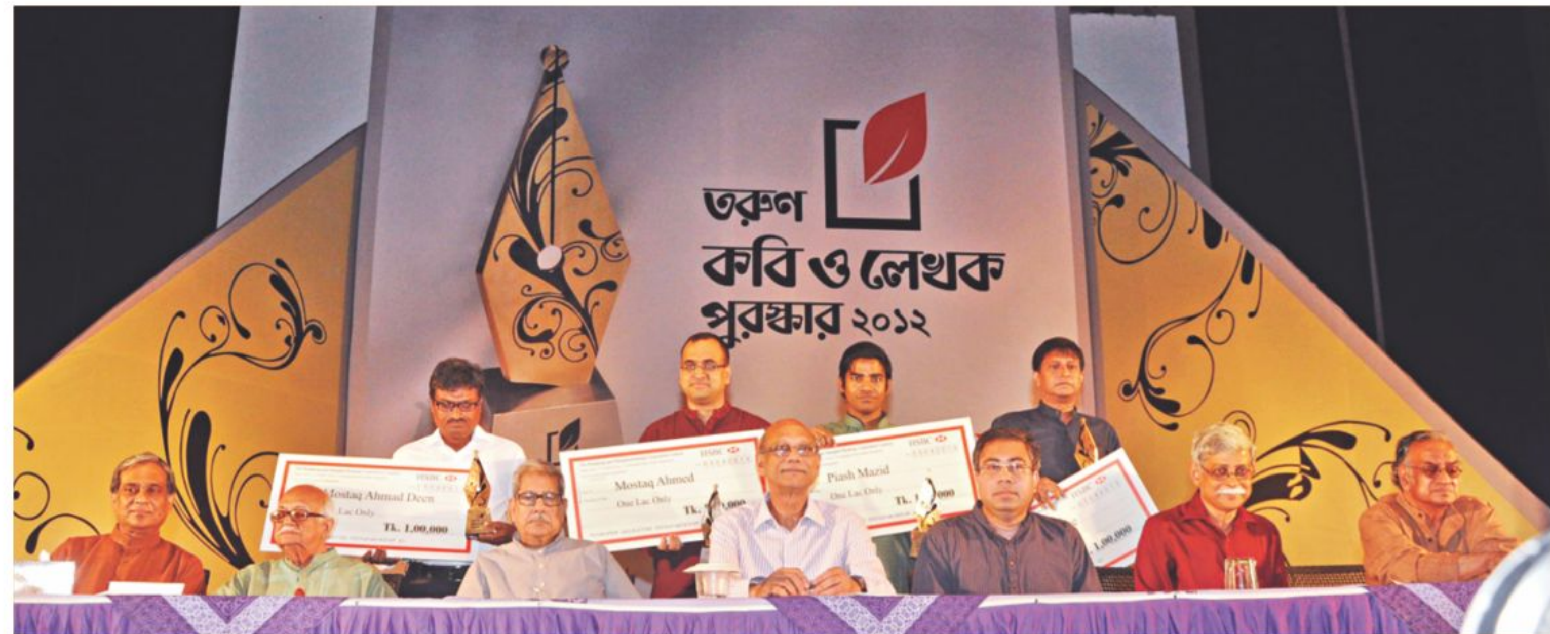
The awardees (back row) seen with the guests at the programme.