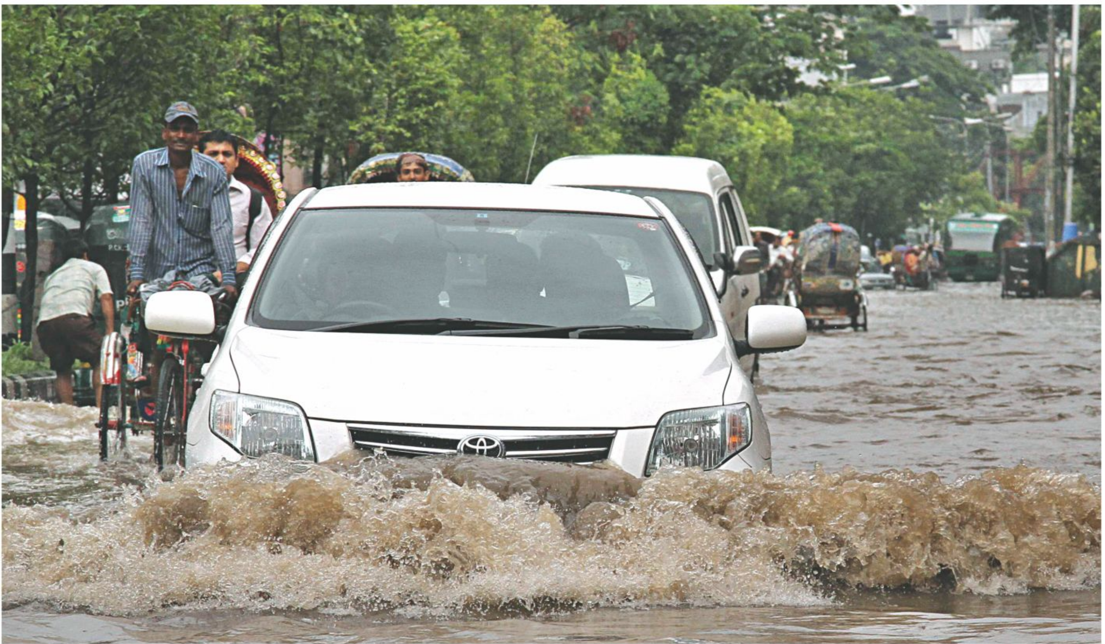
Half submerged motor vehicles in the capital's Rajarbag Police Lines plying through the flooded streets due to a day-long rainfall yesterday.