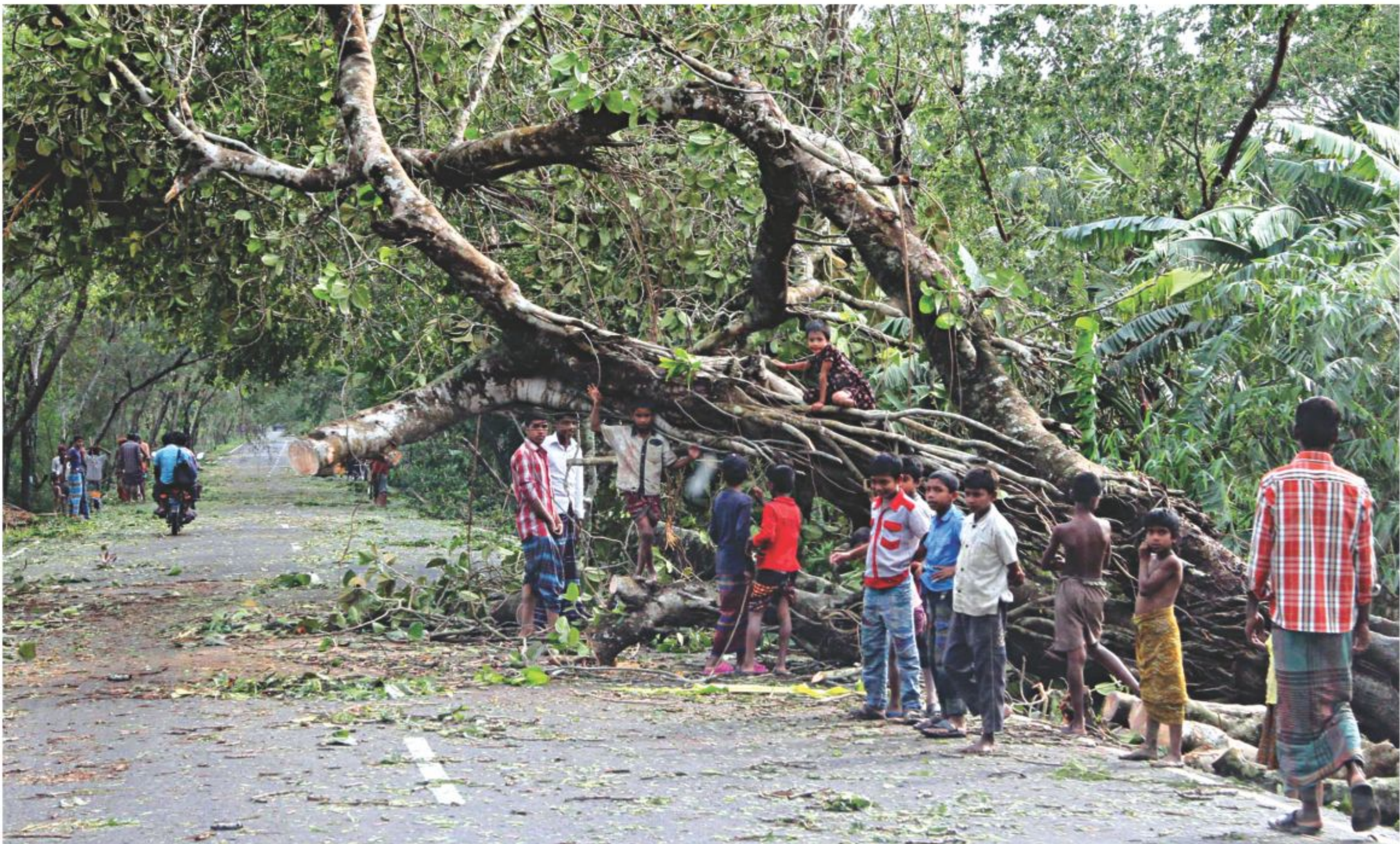
A road, blocked by trees uprooted by cyclone Mahasen at Amtoli in Barguna yesterday, is partially cleared now after the cyclone shifted away from the zone.