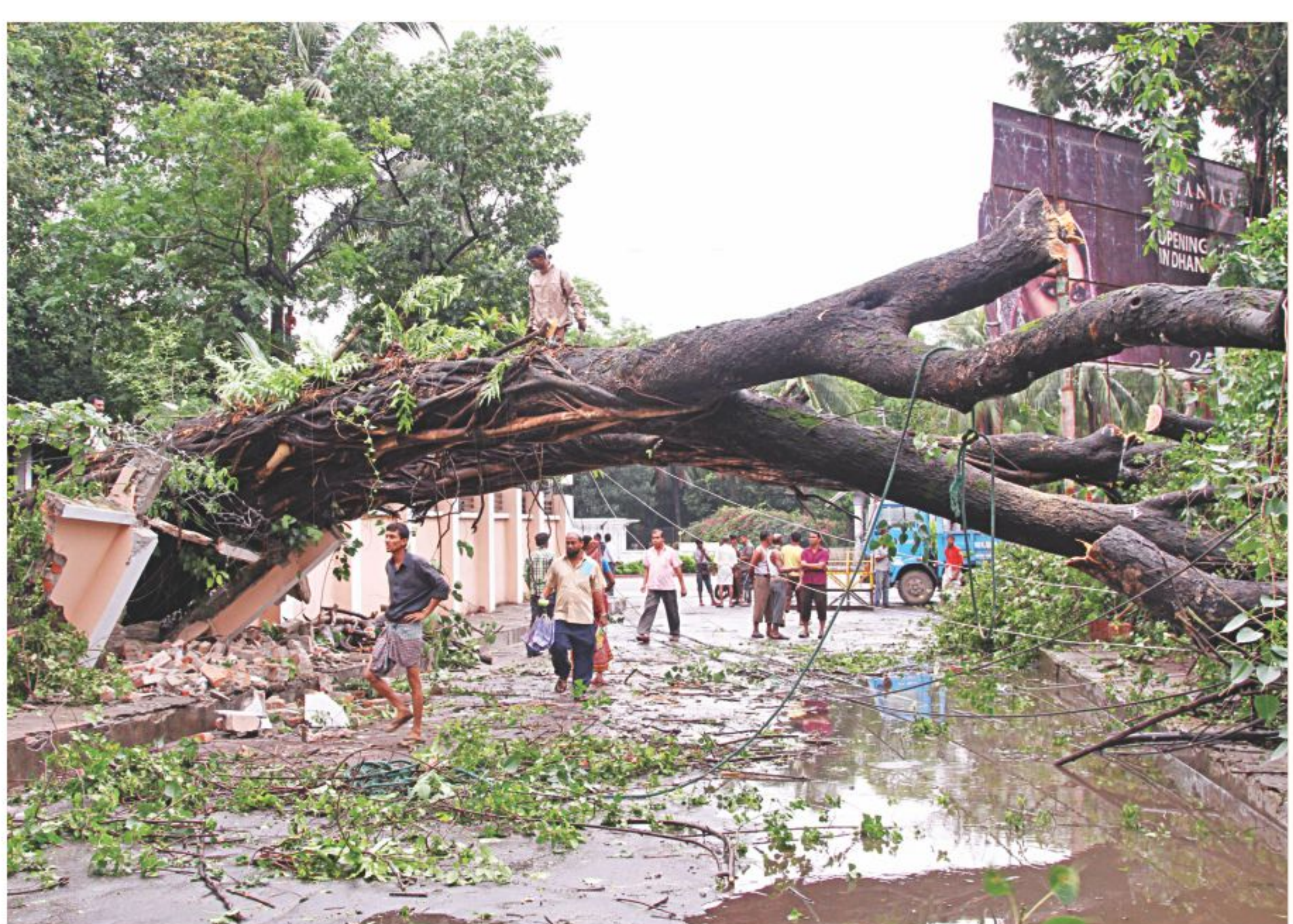
Uprooted during heavy rains and gales yesterday morning, this tree at the Dhaka divisional commissioner's residence lies on the adjacent Minto Road of the capital.