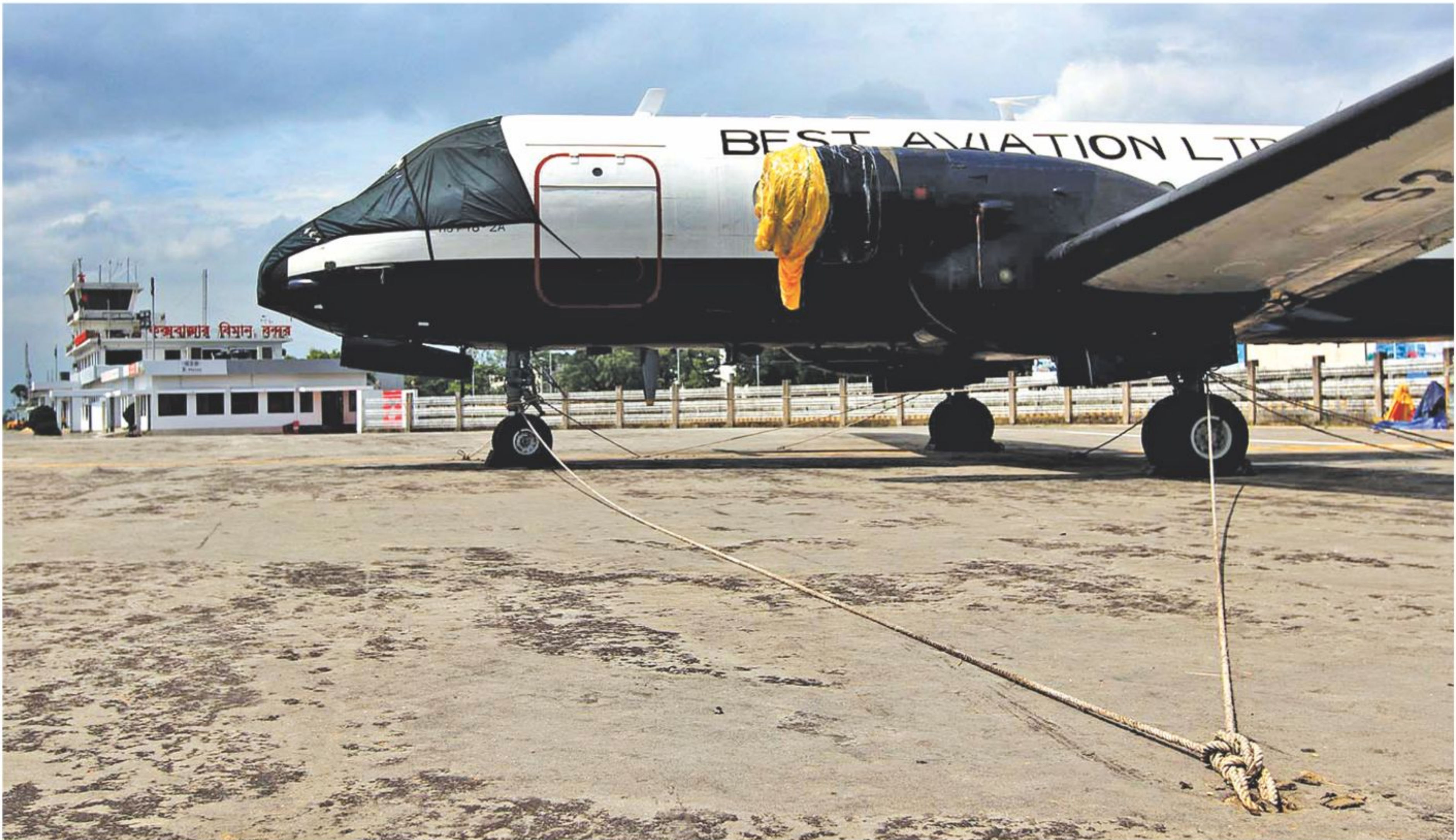
An aircraft is tethered to the ground at Cox's Bazar airport yesterday as cyclone Mahasen approaches Bangladesh yesterday.