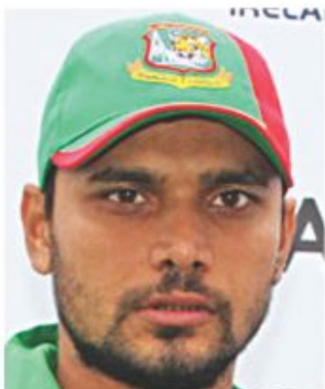
MASHRAFE BIN MORTAZA

The paceman also had good words for Robiul Islam, who picked up 15 wickets in the series. "There was never any doubt regarding his prowess. However, this is just the start. He has a long way to go and a number of things to tackle in the near future."