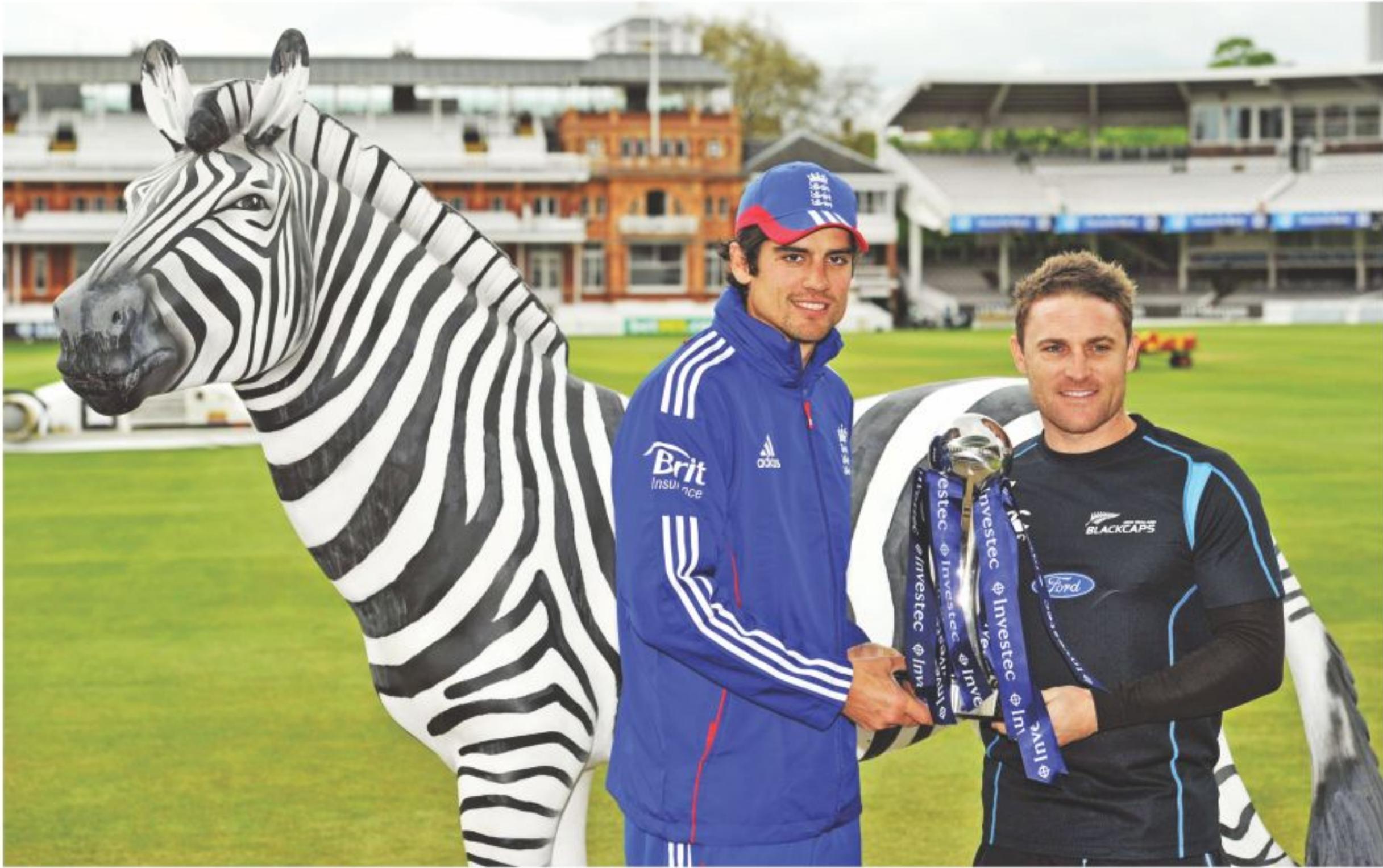
England skipper Alastair Cook (L) and his New Zealand counterpart Brendon McCullum pose with the trophy on the eve of the first Test at Lord's yesterday.